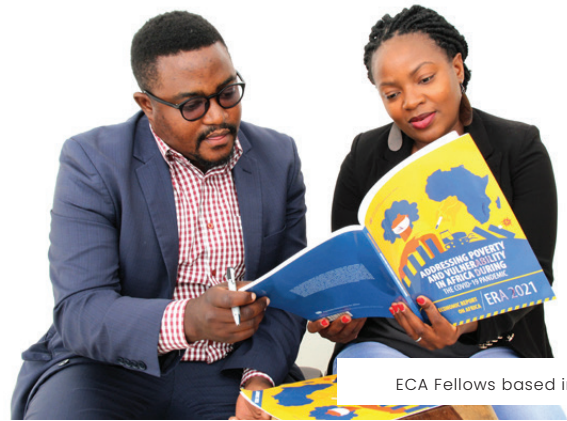
ECA Fellows based in SRO-SA