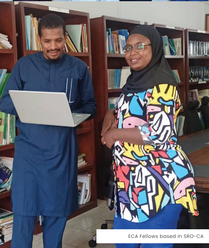
ECA Fellows based in SRO-CA