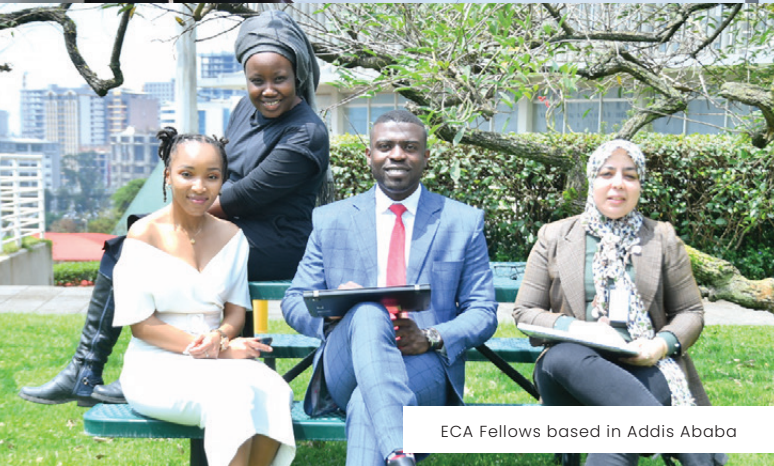
ECA Fellows based in Addis Ababa