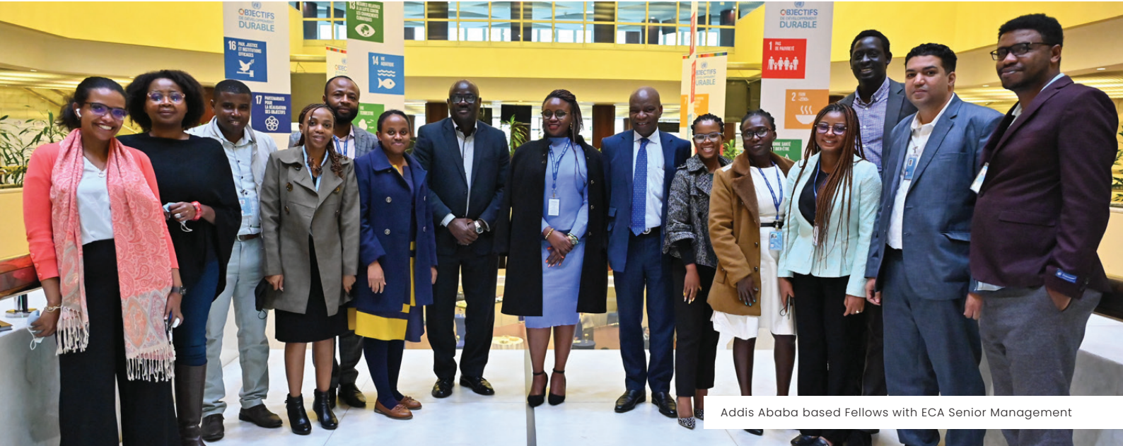
Addis Ababa based Fellows with ECA Senior Management