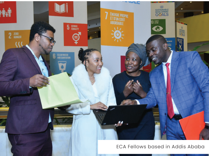
ECA Fellows based in Addis Ababa