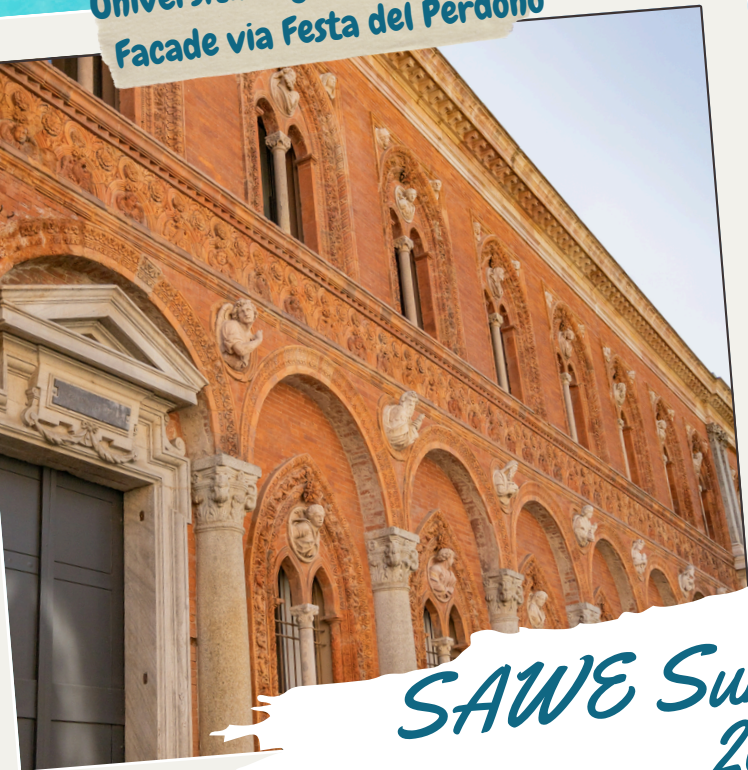
Università degli Studi di Milano Facade via Festa del Perdono