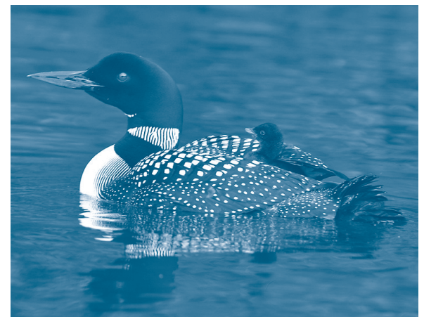
Common Loon – Gavia immer