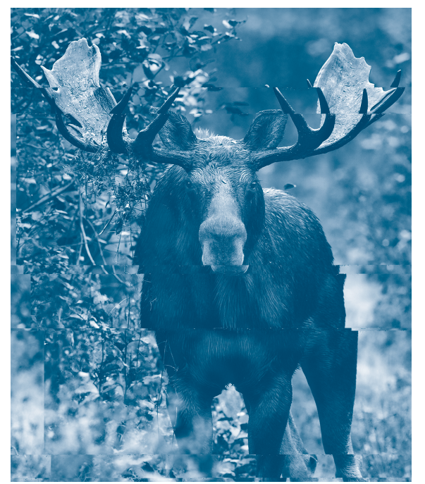
Moose ( Alces alces )

The forests and wetlands are home to birds such as thrushes, woodpeckers, flycatchers, wrens, vireos, warblers, blackbirds, grosbeaks and sparrows. Waterfowl include common mergansers and common loons. Great blue herons, ospreys or "fish hawks," and an occasional bald eagle can be seen in the area. Green River Reservoir and many of the ponds are home to mostly warm water fish species, such as smallmouth bass and yellow perch. Brook trout inhabit the waters and inflowing streams as well as Zack Woods, Perch and Mud Ponds.