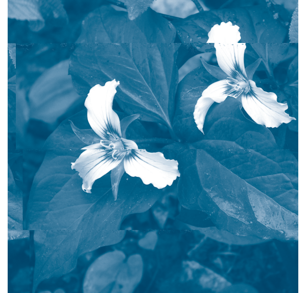
Painted Trillium ( Trillium undulatum )