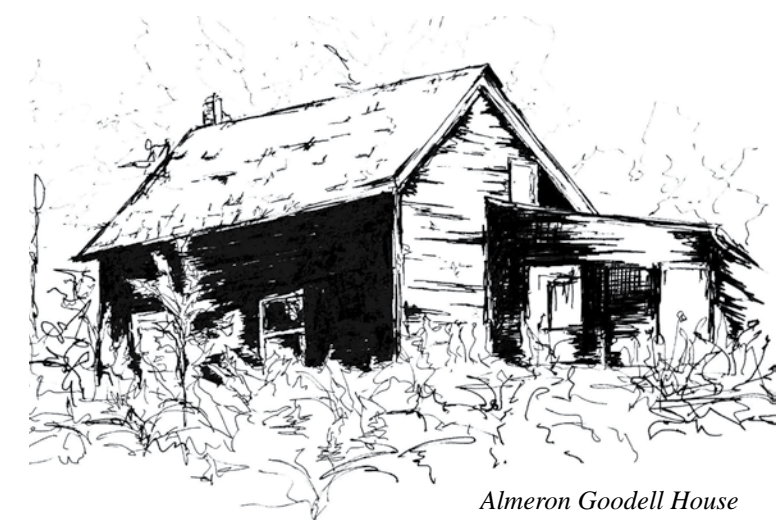
Almeron Goodell House