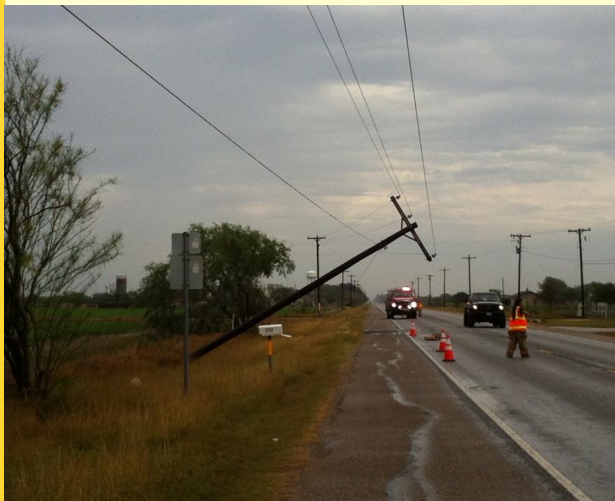
Left: Storm damage north of Los Fresnos on the afternoon of April 28, 2013.