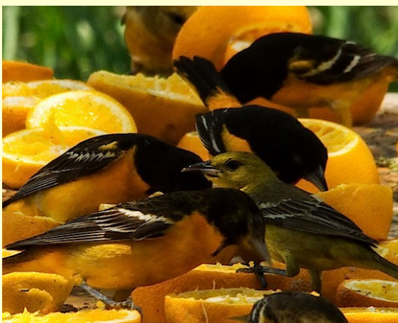
Above: Oranges on the bench, April 27, South Padre Island Convention Center.

Late season cold fronts are always a welcomed sight to residents of the Rio Grande Valley and Deep South Texas. The strong front which moved through in the morning hours of Wednesday, April 24 th was no exception. Not only did it bring record low temperatures to the region, it provided us with much needed rainfall. But to local naturalists, it will be remembered for something far more epic.