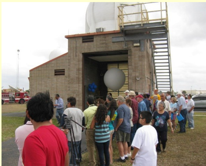
Left: Weather balloon release at NWS Brownsville during the Weather Festival.

It was a very rewarding to see many children inspired to learn more about NWS Brownsville/RGV, from who we are and how we work to protect life and livelihoods. We're planning to host more in the future!