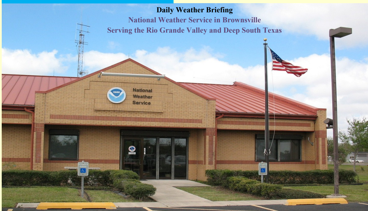
Figure 4. (Below) Home screen Multimedia Briefing .

The briefing can be found on our website at www.weather.gov/rgv by scrolling down to the icon depicting our office (Fig. 4). It will also be available on Facebook, so go ahead and friend us to get your daily dose of weather information. Look for it by early March.