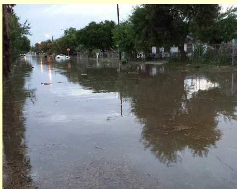
Above: Photo of street flooding just after rains ended near downtown Brownsville, between 4 and 5 PM on November 6, 2013.