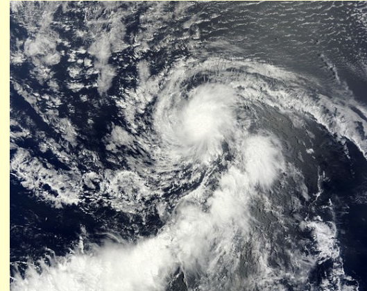
Above: Visible satellite photo of Tropical Storm Dorian over the tropical Atlantic Basin, July 25, 2013. Notice the abundant dry air surrounding the small core. Dry air was a persistent theme through the entire season.

Amid much fan-fare, a busy season was forecast by NOAA (and nearly every forecasting organization) for the Atlantic Basin, which includes much of the North Atlantic Ocean and Gulf of Mexico. By the time the season officially ended in November, 13 cyclones were observed, with only 2 hurricanes. No major hurricanes were seen. Only Tropical Storm Andrea made land-fall in the United States. These numbers were well below pre-season predictions. Why?