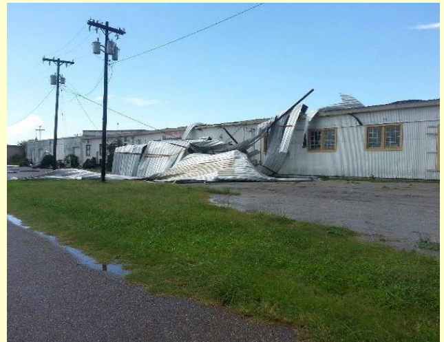
Above: Damage to a warehouse along Business Highway 83 and South Utah Avenue on the east side of Weslaco, June 2, 2013.

• A Break in the Drought Rain finally came, and it arrived in deluges. Over a foot of rain fell in portions of Cameron County during the month. Traditionally, September is the Valley's wettest month.