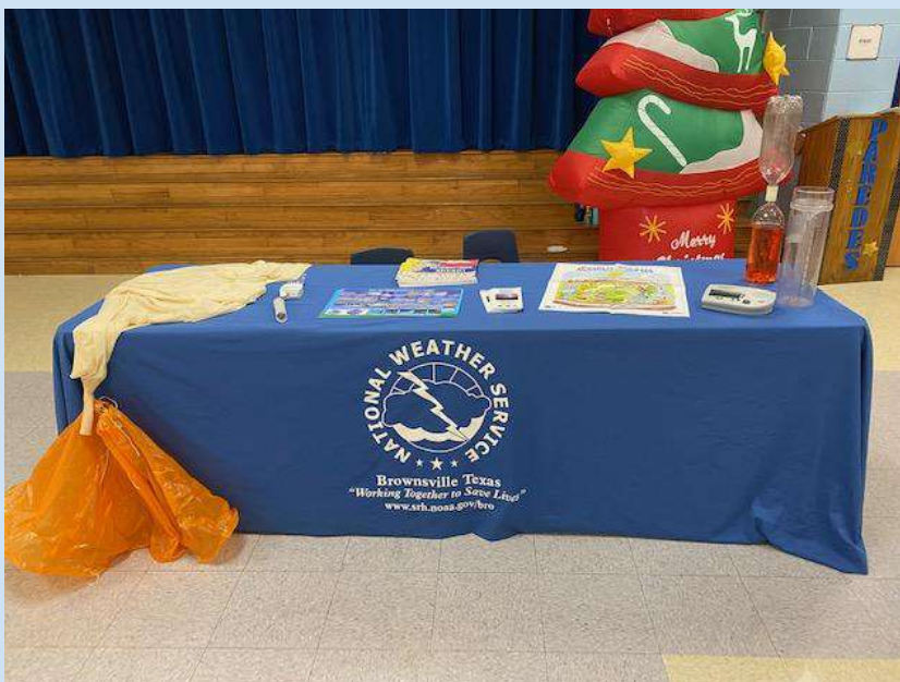
Career Day set up at Paredes Elementary.

I hope with this event and other similar events, I can help inspire future generations of meteorologists or spark interest in the sciences in general.