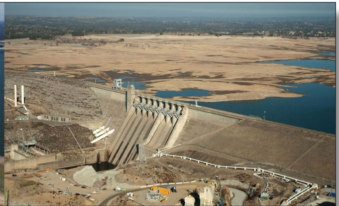
Folsom Lake - January 16, 2014

The Palmer Drought Severity Index (PDSI) is a leading index used to analyze drought. Using temperature and precipitation data to estimate the relative dryness of a region, values less than zero indicate drier than normal conditions, while values greater than zero indicate wetter than normal conditions. PDSI is used to assess drought at seasonal timescales. PDSI, in combination with natural paleoclimate records such as tree rings and ice cores, can be used to put historical periods of drought in context. The Crop Moisture Index (CMI) is a short-term drought indicator that is primarily used in the agricultural sector to make decisions about planting and harvesting crops.