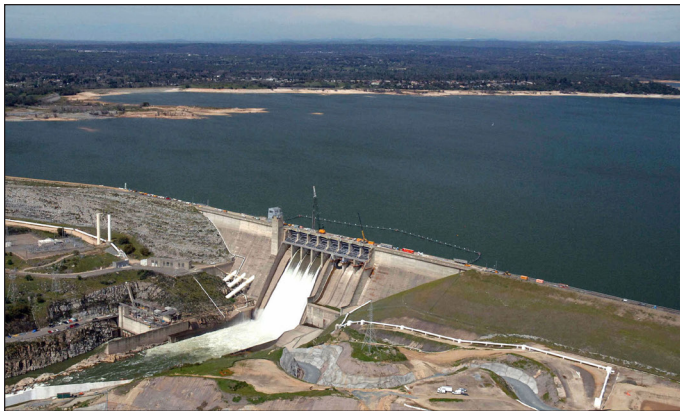
Folsom Lake - July 20, 2011