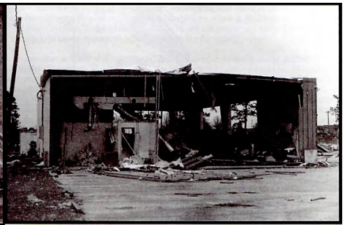
Figure 1-4. Damaged Industrial Park from the Ground.