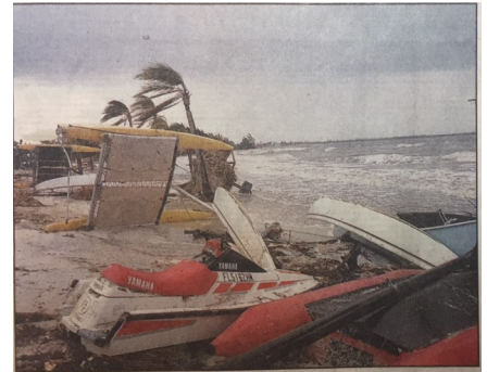
High winds tossed boats all over Saturday in Bahia Beach in Hillsborough County. President Clinton declared 21 counties federal disaster areas.

In total, 44 deaths were attributed to the Superstorm in FL, nearly one-third of the direct deaths across the nation. Destruction from high seas, tornadoes, storm surge, and coastal flooding created a property damage estimate of $1.6 billion, one of the most costly disasters of the 20th century.