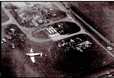
Figure 1-3. Aerial Photo of Ocala Airport including the DC-3.