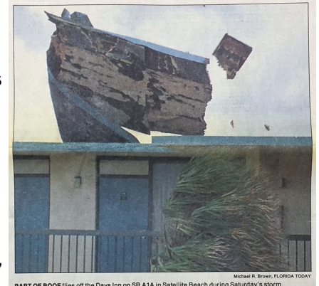
PART OF ROOF flies off the Days Inn on SR 1A in Satellite Beach during Saturday's storm.