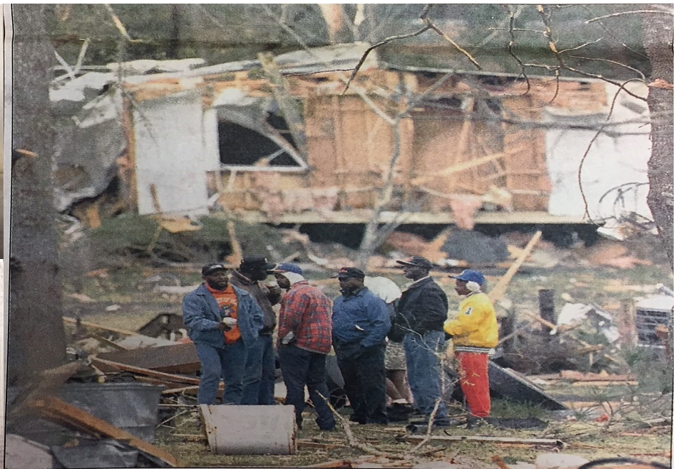
CHIEFLAND RESIDENTS stand among the ruins of their neighborhood Saturday after a tornado swept through late Friday night, killing three and wounding several others.