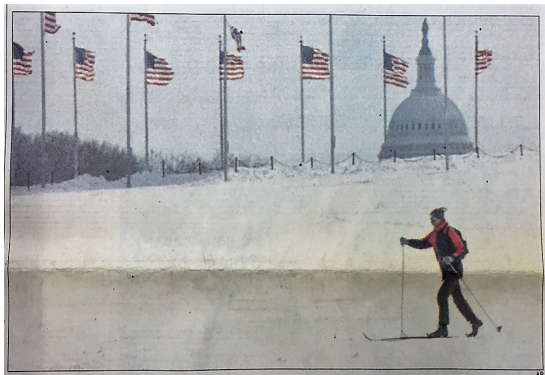
SKIERS CROSS the Mall in front of the Washington Monument as the city began to recover from one of the fiercest winter storms in years. The Capitol is in the background.

While FL received a majority of the severe weather from the 1993 Superstorm, the entire East Coast felt impacts from the intense system. High winds continued across the Appalachians and Deep South, downing trees and powerlines and leaving thousands of residents without power. Intense winds were also recorded in the Northeast, where a peak wind gust of 144 mph was measured at Mt. Washington, NH.