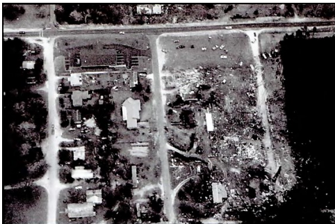
Figure 1-1. Aerial photo of destroyed homes.