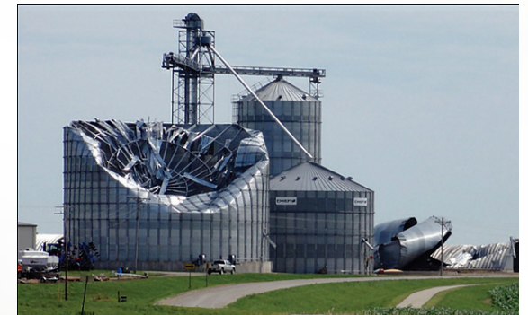
After a tornado, watch out for dangerous debris, such as sharp metal, glass, or downed power lines.