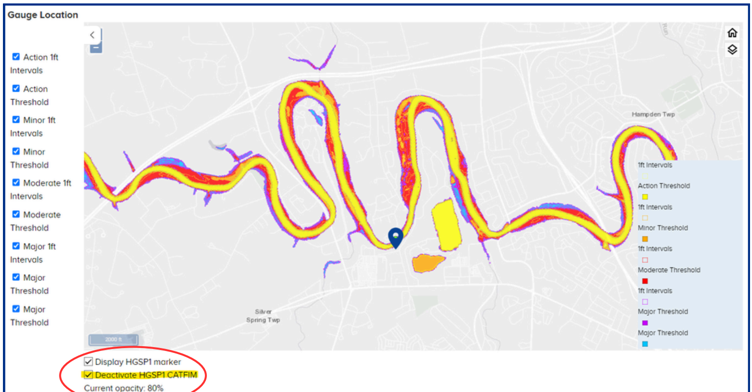
Figure 2: Screenshot of the Gauge Location with CatFIM thresholds enabled.