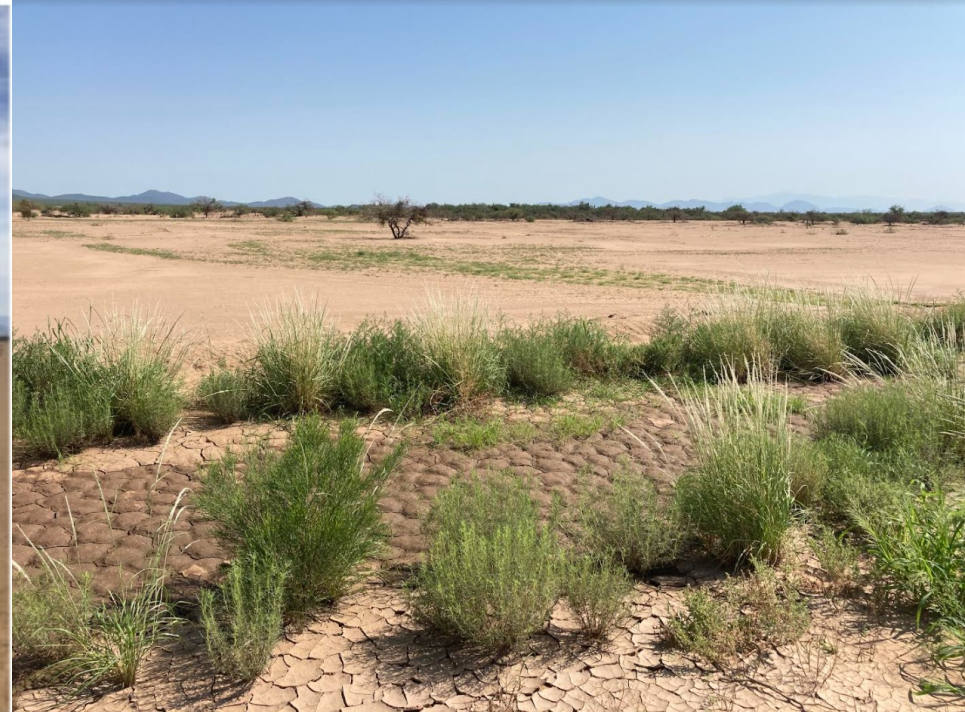
Figure 4: 98 Ranch abandoned farmland, May 2016, looking north