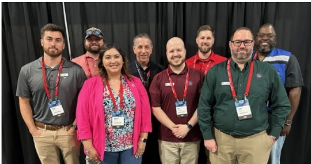
WFO Corpus Christi and Brownsville meteorologists at the Coastal Bend Hurricane Conference

As the 2024 Atlantic Tropical Season nears, WFOs Corpus Christi and Brownsville/Rio Grande Valley participated in the 13th annual Coastal Bend Hurricane Conference hosted by the Coastal Bend Emergency Management Association and Nueces County. With an audience of over 1,000 people, including community stakeholders, emergency managers, a range of local, state and federal government responders and policy makers, volunteer organizations, healthcare professionals and industry representatives, several members from both WFO Corpus Christi and WFO Brownsville/Rio Grande Valley presented important topics in front of the large crowd. The conference started