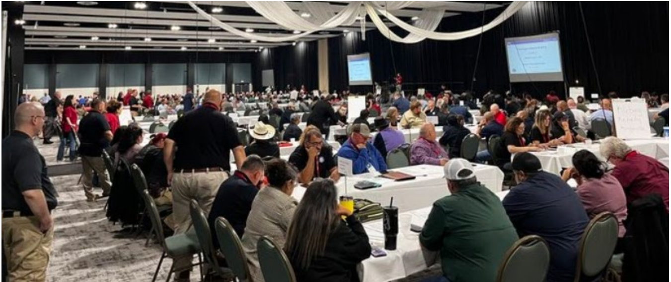
Various emergency management agencies set up for the hurricane tabletop exercise