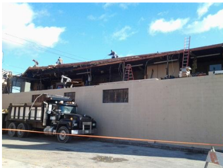
Damage to the 2 nd story of a concrete block warehouse structure.

A concrete block warehouse structure suffered damage along the west side when a few windows broke and a section of the lift roofed off. Due to the engineering this caused the west side of the second story wall to crumble.