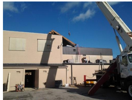
Roof damage to a concrete block warehouse structure.

Severe Thunderstorm Watch number 557 was in effect from 12:47 am, and was cancelled for the Huntington area at 4:39 am. A severe thunderstorm warning was issued at 2:15 am valid through 3:15 am.