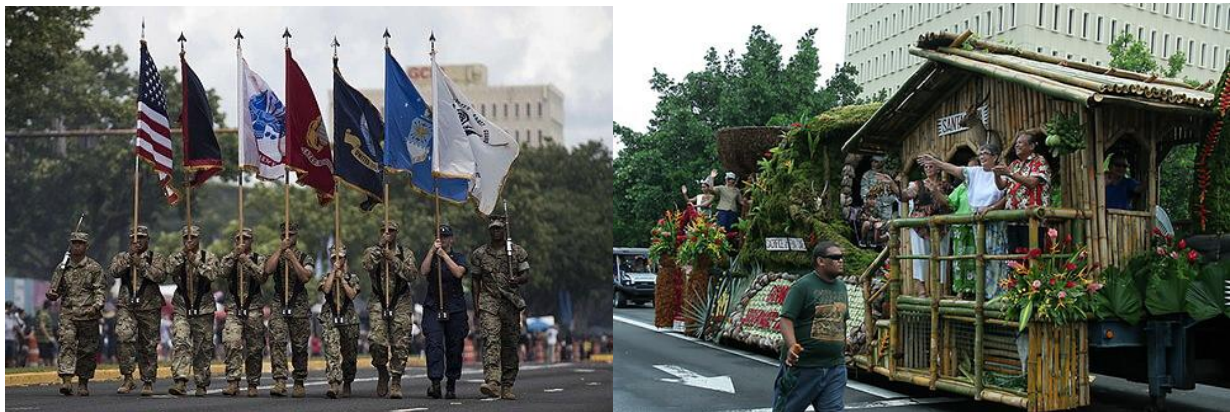
Liberation Day Parade

Saipan's largest fishing derby is also held annually around this period. It is not advisable to plan any community or fishery meetings as many will travel from Guam to join.