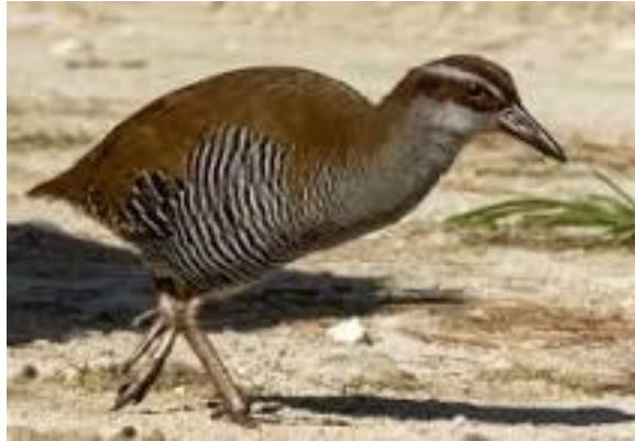
Guam 'Ko'ko' Rail

There are other endangered creatures found on Guam. Consult with DAWR for a complete list. https://doag.guam.gov/dawr/