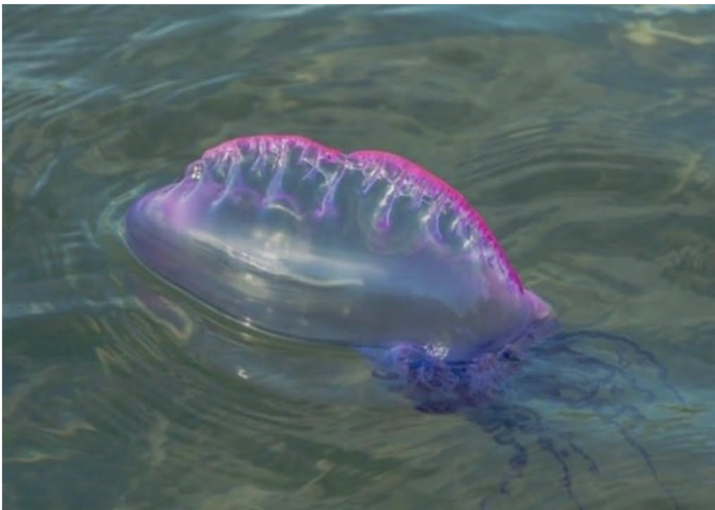
Portuguese Man o' war

Guam sees its share of jellyfish. Portuguese man-o-war or boxed jellyfish are usually found in the waters or along the beaches, especially after a period of high surf. Washed up man-o-war or boxed jellyfish can still sting even if they are dead. Rinse with vinegar to keep the sting from firing. Do not rinse with fresh water (like tap or bottled water) because that can make more stingers fire.