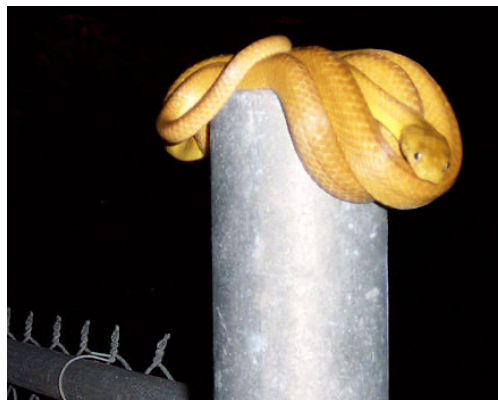
Brown Tree Snake

The snake is aggressive. Its fangs are located at the rear of its mouth, so the bite delivers toxins in small doses. Though it is mildly venomous for adult humans, young children can have reactions, and its bite is still quite painful and may require a visit to the doctor. Researchers have discovered that brown tree snakes in Guam can twist themselves into "lassos" to climb trees and poles.