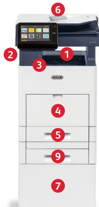
Xerox® VersaLink® B605 Multifunction Printer Print. Copy. Scan. Fax. Email.