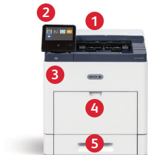
Xerox® VersaLink® B600 Printer Print.