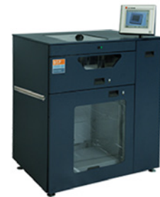
C.P. Bourg® Sheet Feeder (BSF)

The BSF includes two separate feeding compartments: a lower high-capacity tray that can accommodate pile heights up to 20" (508 mm) and an upper feed drawer that accommodates pile heights up to 6.3" (160 mm) of cover or insert sheets. When in bypass mode, the upper feed tray can be used as a cover feeder. A hand scanner is used to read JDF data from job-specific printed banner sheets that travel with the stacks. The BSF is equipped with OMR (optical mark recognition) and double- and missed-sheet detection from both compartments. It also detects when either tray is empty.