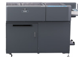
Duplo® DC-645 Slitter/ Cutter/Creaser

Accepted sheet sizes are 8.26" x 8.26" to 14.56" x 25.59" (210 x 210 mm to 370 x 650 mm) with paper weights of 110 to 350 gsm (80 lb Text to 130 lb Cover). Paper types are text, uncoated, coated and laminated.