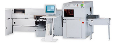
Xerox® Automated Book Factory Solution

The Xerox® Automated Book Factory Solution is a complete solution to grow your business to include book publishing. Documents are printed, collated and perfect bound in a seamless production process—emerging from the system ready to be packed and shipped. The ability to switch from inline to offline at the push of a button and optionally transform A4-size sheets into perfectly bound A5 books makes the Manual+Book Factory the ideal perfect binding system for both commercial and in-plant printers looking to expand their finishing repertoire while keeping costs down and meeting tight turnaround times.