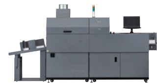
Duplo® DDC-810 Offline UV Spot Coater

Differentiation for high-quality prints is a premium, and no longer available only to the production market! The Duplo DDC-810 is an offline UV spot coater targeted toward mid- to entry-production arenas. Compact and user friendly, it achieves precise, valued UV coating by an accurate CCD reading system and inkjet control. Add value to your print with a layer of spot UV embellishment that you can touch and feel.