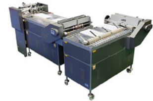
Rollem JetSlit System