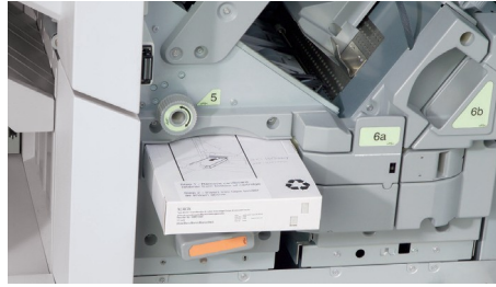
Easy-to-load Tape Cartridges

Operating the Xerox® Tape Binder is easy, with controls that are designed to allow you to define job settings, view status and perform basic operation right at the point of need: the tape binder's Operator Control Panel. Changing binder tape strips is easier than ever with convenient, easy-to-load cartridges.