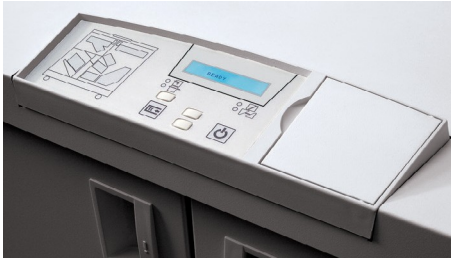
Convenient Control Panel