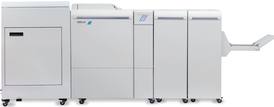
Plockmatic Pro50/35 Booklet Maker, manufactured by Plockmatic International AB

Create professional-quality booklets at rated speed with a compact, affordable inline solution.