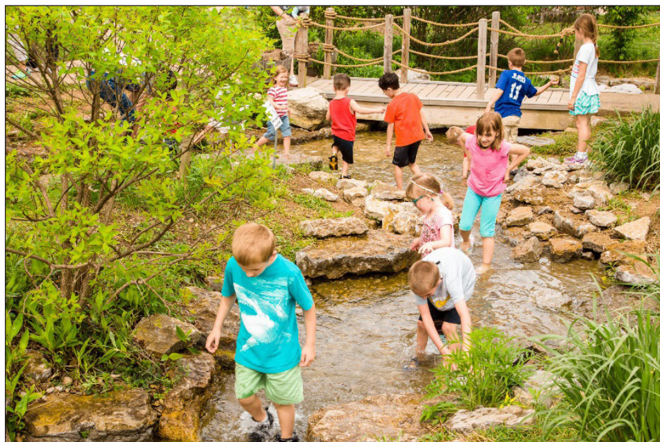
Figure 4. Outdoor classrooms involving youth often have elements of play. The goal is to encourage young learners to explore their environment.

Creating an outdoor classroom is not a one-person show. You will need help and cooperation from others in your organization, such as your supervisor or principal, fellow educators, and grounds personnel. It's best to seek this type of input early in the