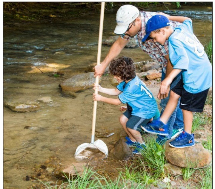
Figure 2. Outdoor classrooms can involve a planned layout, such as that of the Children's Garden at The Arboretum in Lexington, KY (left), or a natural layout, such as a stream (right).