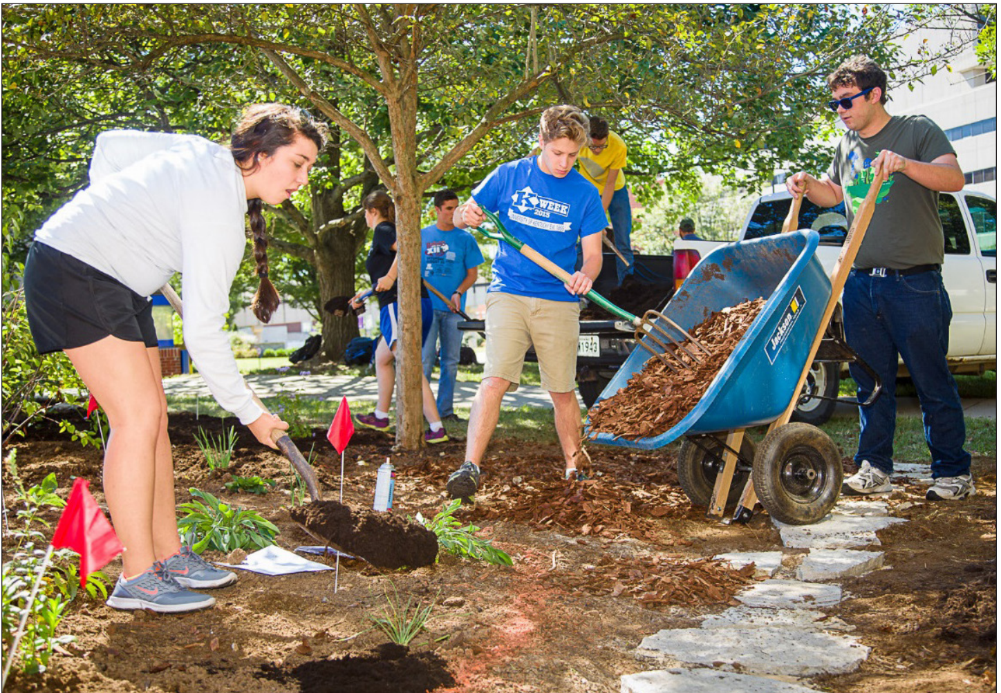
Figure 7. Seek out volunteers to help with the design, implementation, and maintenance of your outdoor classroom.

Be sure to consider the costs of personnel (salary and benefits), materials and supplies, equipment, travel, and consultants.