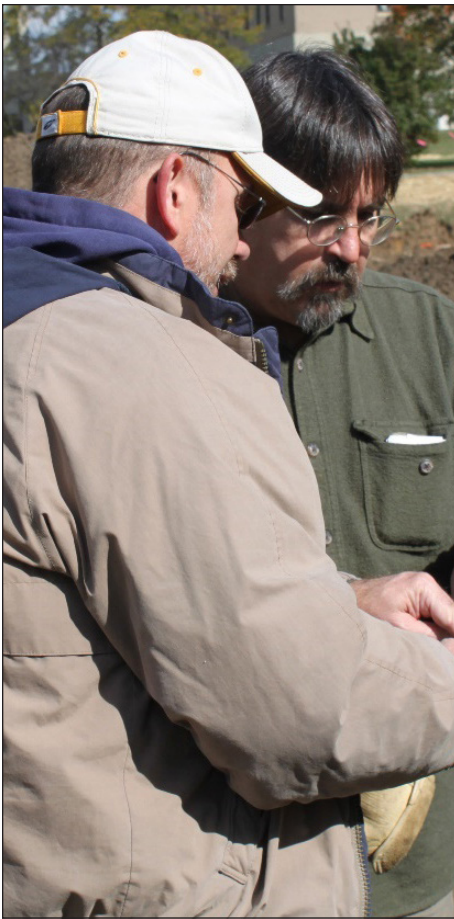
Figure 8. A detailed project schedule will help ensure the successful completion of your outdoor classroom. Make sure to identify a responsible party and completion date for each task.