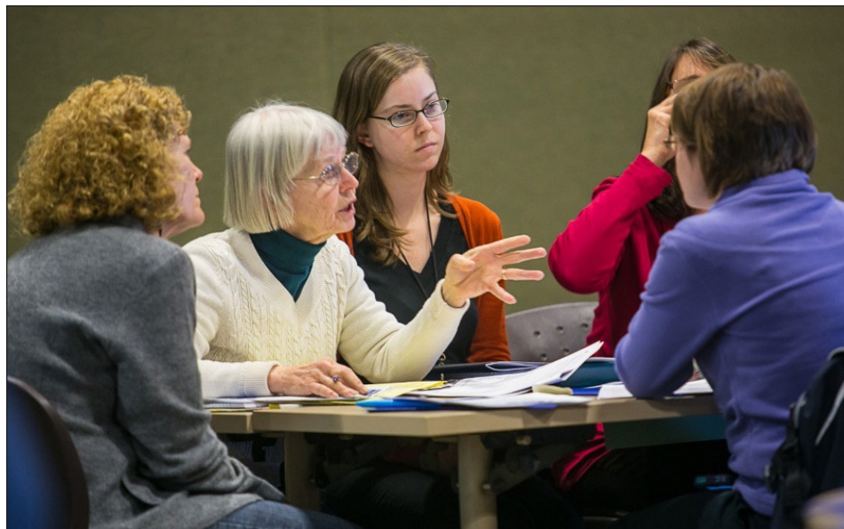
Figure 5. Creating an outdoor classroom is a team effort. Identify team members who share a similar passion and vision for the project. When identifying team members, consider the different skills and perspectives each member brings to the team.

In many cases, you will need special permission to construct an outdoor classroom