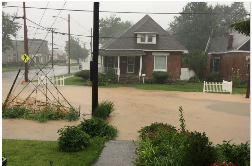
Figure 10. Installing erosion control measures, such as straw and mulch, is a critical yet often overlooked aspect of constructing an outdoor classroom (top). If left unprotected, rainfall will easily erode bare soil, which is then transported offsite in the form of runoff (bottom).

Waste is also generated when building the components of the outdoor classroom (e.g., composting bins, rain barrels, raised bed gardens) and when planting.