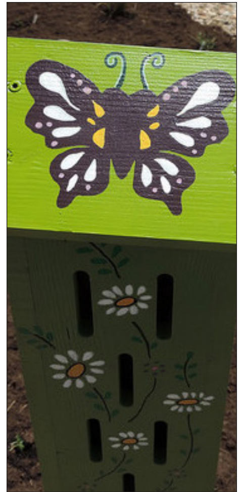
Figure 13. Personalize your outdoor classroom by adding art, such as painted fences, butterfly houses, or literary characters.