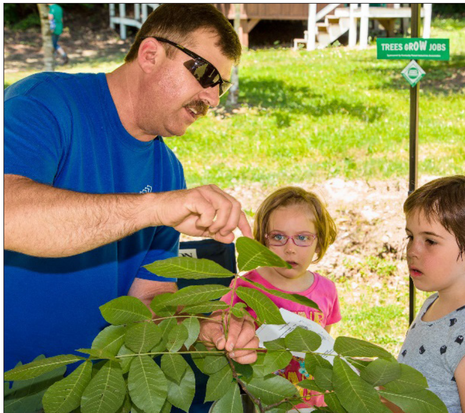
Figure 3. When developing an outdoor classroom, start with a vision of what you would like to achieve. Don't be afraid to think big.

Try to answer the question, "If I could have any outdoor classroom I wanted, what would it look like?"