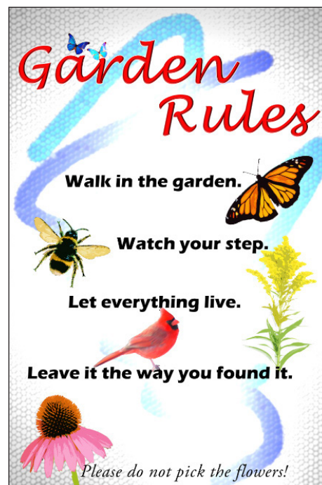
Figure 14. Use signage to explain the rules of use for the outdoor classroom, identify features, or even thank sponsors.

The use of art, particularly student-produced art, is a great way to personalize and enhance your outdoor classroom (Figure 13). Consider painting fences, gates, and the exterior of raised bed gardens to add color and interest to your outdoor classroom. Students can create pet rocks to line walking paths or structures of animals, real or literary, to incorporate into the outdoor classroom. Adding butterfly houses, birdhouses, and similar structures can combine aesthetics and functionality. Local professional artists may also be willing to contribute sculpture to your outdoor classroom, adding additional instructional opportunities for combining science and creative studies. Always consider the durability of art pieces, as they will be exposed to the elements year-round unless sheltered.