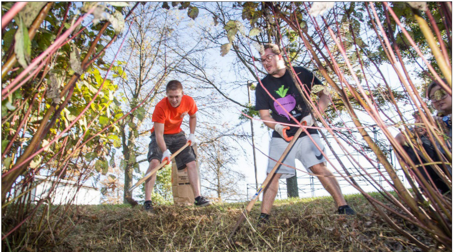
Figure 12. Outdoor classrooms require periodic maintenance, the level of which will vary depending on the time of year and project location. When designing your outdoor classroom, carefully consider the anticipated required level of maintenance.