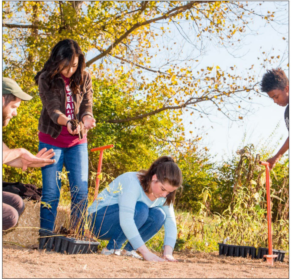
Figure 11. Whenever possible, use native plants in your project.

After your outdoor classroom is constructed, the work is not done. Periodically, maintenance will be required (Figure 12). Be sure to allow for time to maintain the space at regular intervals. The frequency or regularity of these intervals will depend on the type of maintenance required. Remember, the anticipated maintenance level should be considered during the design phase. Maintenance will also vary with the time of year. For example, more regular weeding may be needed during the summer months. Whenever possible, compost plant material generated from the maintenance of your outdoor classroom.