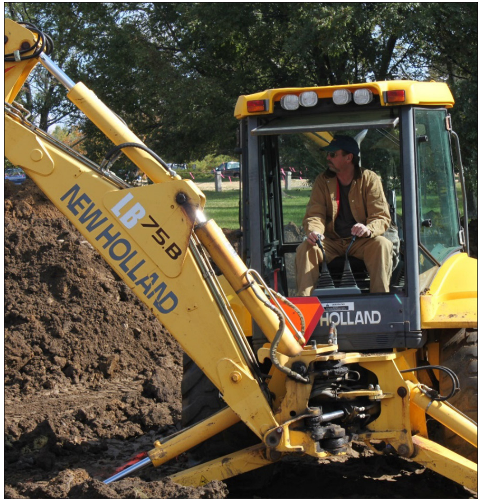
Figure 9. If your project requires the use of heavy equipment, seek out qualified operators in the planning stages.

Ready to get to work? One of the first tasks is to create a project schedule listing each