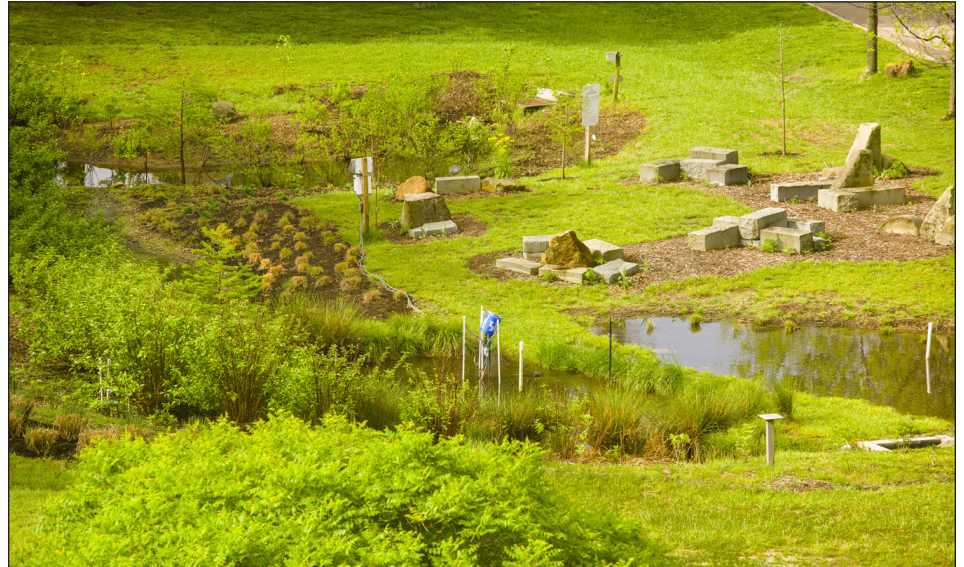
Figure 1. This rain garden, on the University of Kentucky campus, provides students with opportunities to study and research many topics related to water, soils, and plants.

An outdoor classroom can be as simple as a stream, woods, or patch of soil. Even a parking lot can serve as an outdoor classroom. In other words, you can create an outdoor learning environment without construction or expense. However, an outdoor classroom often involves a space with a carefully planned layout, much like that of an indoor classroom (Figures 1 and 2). Outdoor classrooms provide many benefits and can serve as important resources for teachers, 4-H Youth Development agents, and other educators.