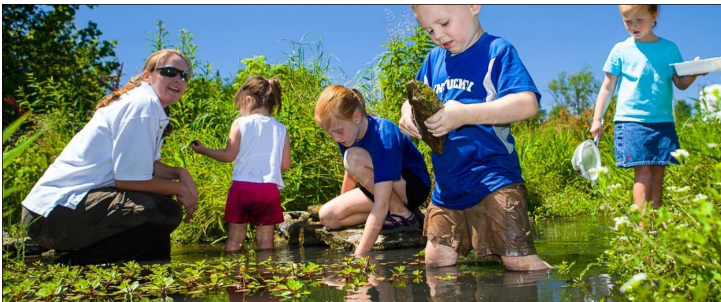
Figure 6. Because the outdoor classroom created at Millcreek Elementary, in Lexington, KY, involved restoring a stream, local, state, and federal permits were required in addition to school board approval.

should you start? Check out what others have done. A great place to start is with an internet search. Look for inspiration on Pinterest. Take a road trip to look at other outdoor classrooms firsthand. A great first stop is the Kentucky Children's Garden at the Arboretum . No perfect design exists for outdoor classrooms. Design your outdoor classroom to align with the vision, goals, and objectives established for your project. When sketching out your initial design, draw to scale. Graph paper and aerial images can help you better visualize your design.