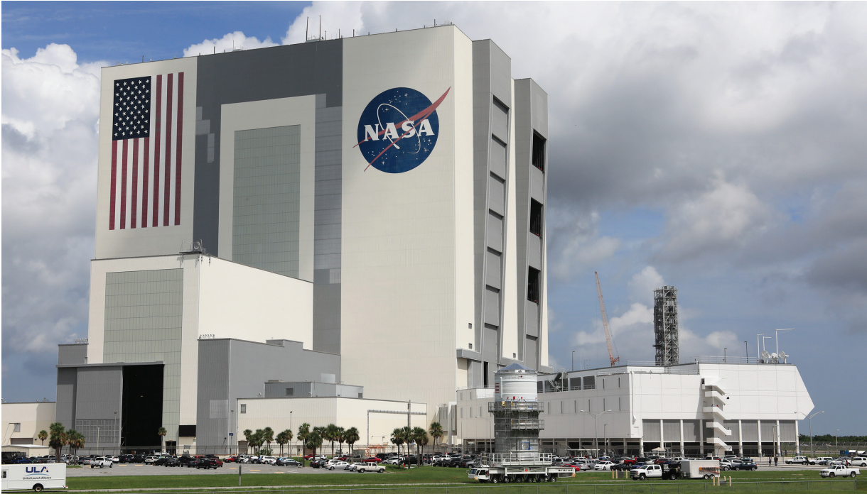
NASA's Vehicle Assembly Building at Kennedy Space Center in Florida was used to assemble and house American-crewed launch vehicles from 1968 to 2011. At 3,684,883 cubic meters, it is one of the largest buildings in the world by volume.