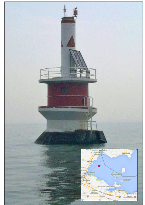
Toledo meteorological station located at the end of the Toledo shipping channel in the western basin of Lake Erie.