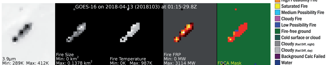
GOES-16 imagery of the Rhea Fire in Oklahoma on April 13, 2018, showing the ABI 3.9 \mu\text{m} shortwave infrared band (left column), and the various outputs of the fire detection and characterization product. From left: fire size, fire temperature, fire radiative power, and fire mask. Fire radiative power is shown in colors from black to red for 0 to 1000 megawatts (MW), red to yellow for 1000 to 2000 MW, and yellow to white for 2000-3000 MW.

The FDC product looks for hot spots, attempts to determine the background temperature without fire present, corrects for solar contamination and water vapor attenuation, and provides fire characteristics for the detected