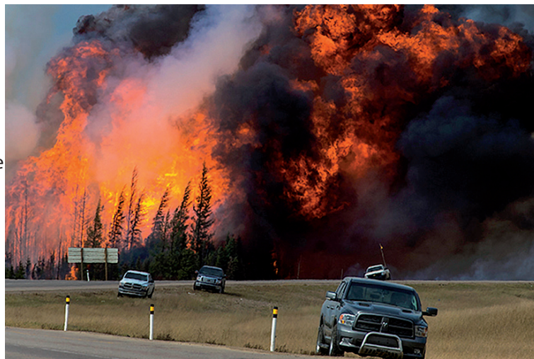
Flames tower above the treeline next to Highway 63 south of Fort McMurray, Alberta, Canada, on May 7, 2016.

Fires, whether naturally occurring or manmade, have substantial impacts upon society. Wildfires can destroy vast tracts of land, releasing tons of aerosols and gases into the atmosphere, while destroying homes, wildlife habitats, and valuable resources. Recording and monitoring fires from ground-based observations is a labor intensive and expensive process that results in an incomplete record. Satellites allow for detecting and monitoring a range of fires, providing information about the location, duration, size, temperature, and power output of those fires that would otherwise be unavailable. With the GOES-R Series, this information can be used to track fires in real time, provide input data for air quality modeling, and help separate the impact of fires from other sources of pollution.