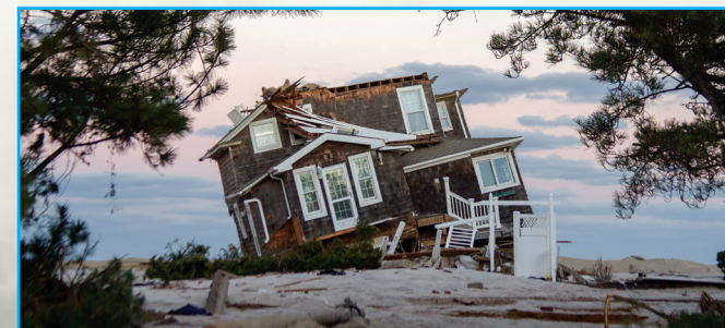
Mantoloking, N.J., Nov. 5, 2012 - This house was destroyed by the storm surge of Hurricane Sandy.