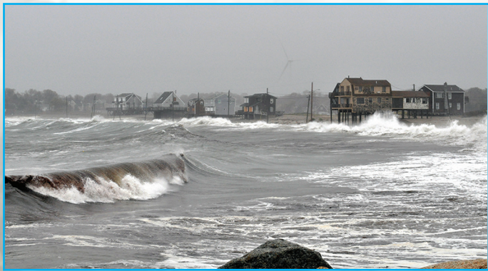
Scituate, Mass., Oct. 29, 2012 - The few summer homes left standing after the Perfect Storm in 1991, stand ready for the tidal surge that is still hours away.