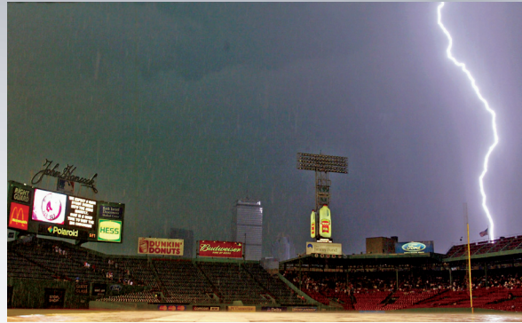
Stadiums and other outdoor venues should have a lightning safety plan.

Finally, some victims were struck inside homes or buildings while they were using electrical equipment or corded phones. Others were in contact with plumbing, outside doors, or window frames. Avoid contact with these electrical conductors when a thunderstorm is nearby!