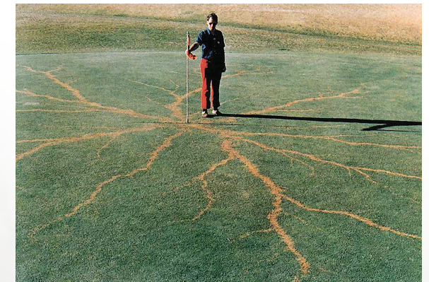
Lightning discharge on a golf green.

For more information, visit www.weather.gov/lightning