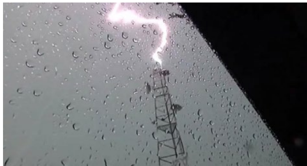
Figure 2: Lightning strikes a communications tower.

Check NOAA Weather Reports: Prior to beginning any outdoor work, employers and supervisors should check NOAA weather reports ( weather.gov ) and radio forecasts for all weather hazards. OSHA recommends that employers consider rescheduling jobs to avoid workers being caught outside in hazardous weather conditions. When working outdoors, supervisors and workers should continuously monitor weather conditions. Watch for darkening clouds and increasing wind speeds, which can indicate developing thunderstorms. Pay close attention to local television, radio, and Internet weather reports, forecasts, and emergency notifications regarding thunderstorm activity and severe weather.