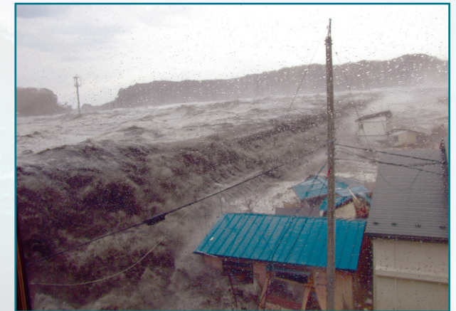
Tsunami striking Miyako City, Japan (2011).

For more information, visit www.weather.gov/tsunamisafety