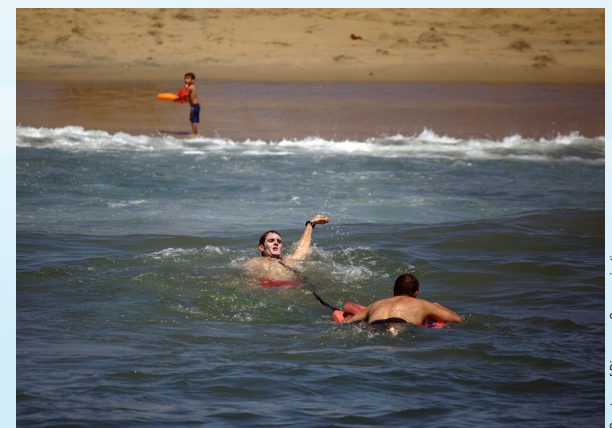
A lifeguard rescues a swimmer caught in a rip current.