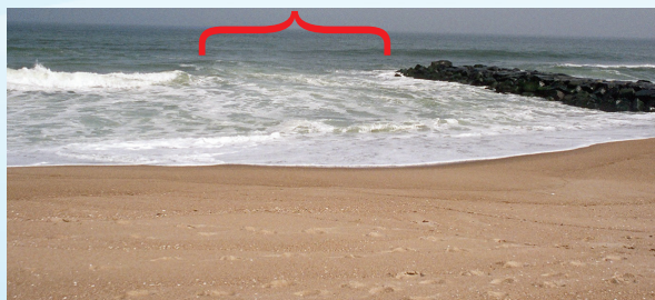
Rip currents often form near coastal structures.