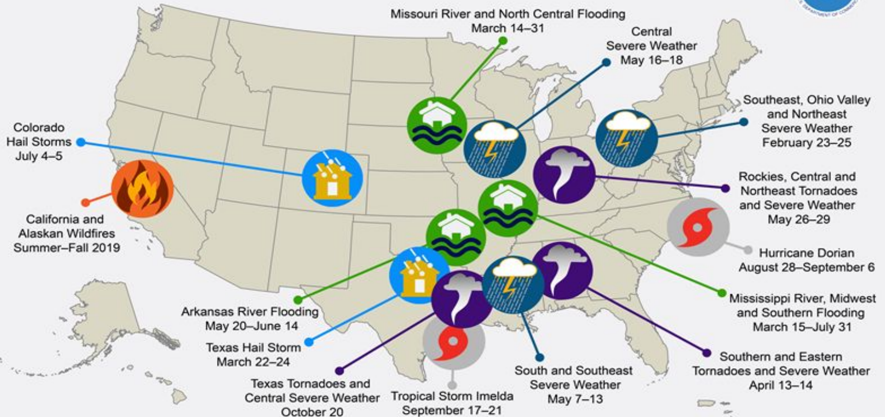
This map denotes the approximate location for each of the 14 separate billion-dollar weather and climate disasters that impacted the United States during 2019.