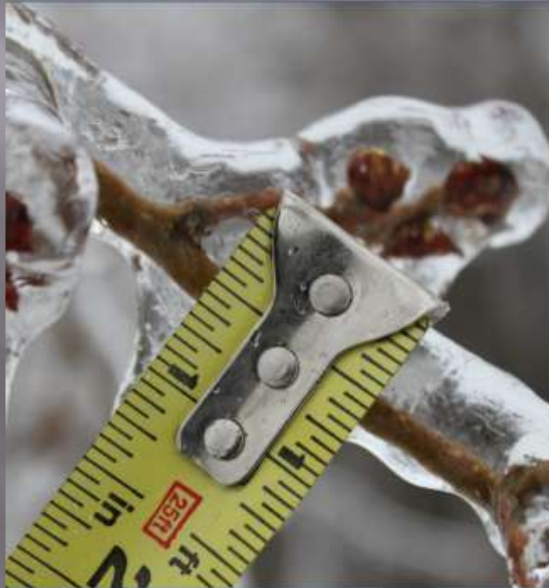
Example of one-dimensional ice thickness