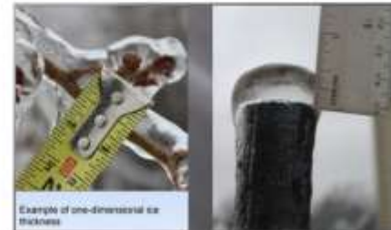
Example of one-dimensional ice thickness

Measure and report ice accretion on branches or other flat objects