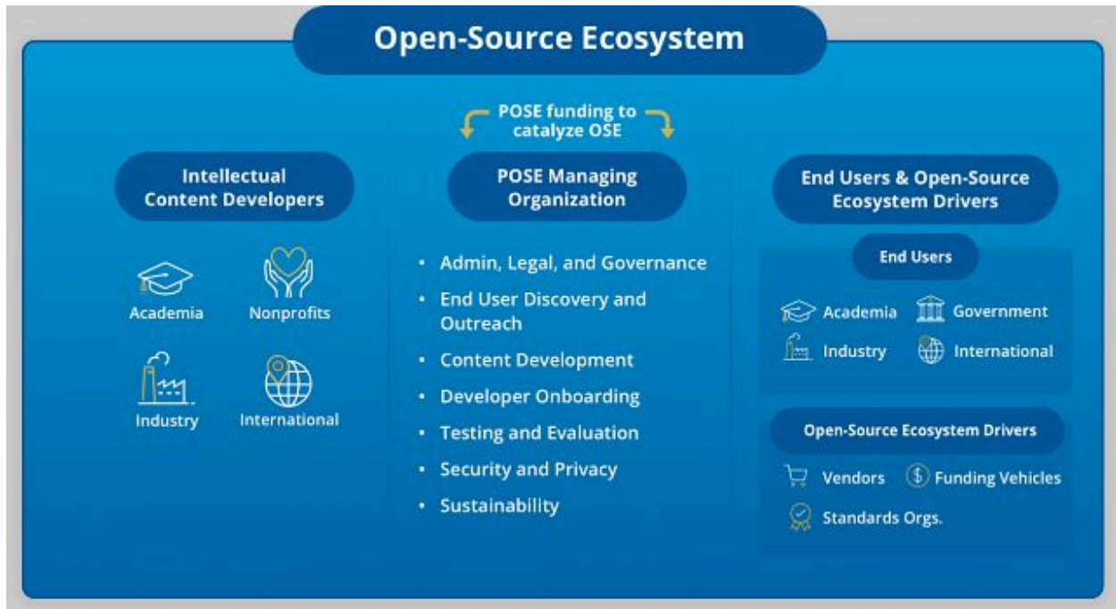
Figure 2. Role of the POSE Managing Organization

An OSE supported by POSE, as shown in Figure 2, will comprise three components: a distributed community of intellectual content developers from academia, industry, and/or the non-profit sector; a community of third-party end users in research, industry, government, and/or other sectors – some of whom may also be intellectual content developers; and a managing organization. POSE funding will support the establishment of the managing organization whose role includes all the functions described above and whose overarching objective is to ensure sustainability of the OSE. The primary distinction between Phase I and Phase II is that Phase I scoping and planning projects are intended for organizations that need more experience and knowledge for building the distributed intellectual content developer and end user communities around an open-source product. Phase I project teams will also benefit from learning more about the non-technical roles of a POSE managing organization – e.g., corporate governance, legal and administrative functions, licensing, fundraising, etc.