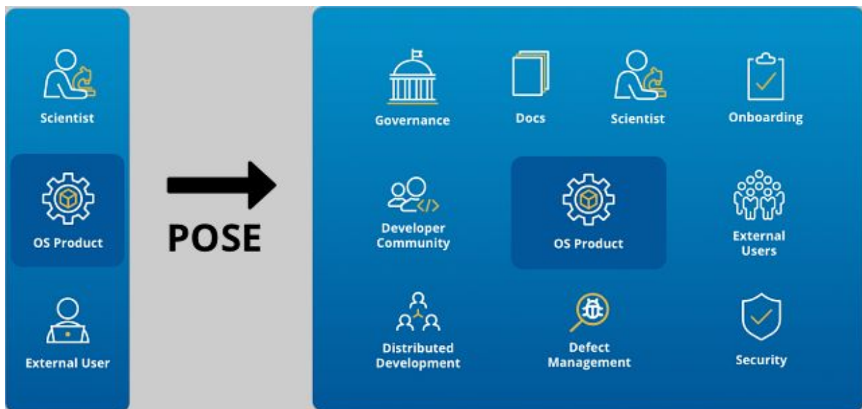
Figure 1. Transition from Open-source Product to Open-source Ecosystem

As shown in Figure 1, the transition from open-source product to OSE can be conceived as a continuum. At one end of this continuum is an early stage open-source artifact that, for example, may have been developed by a scientist for a specific use and has been adopted by a small number of users. At the other end is a fully developed OSE based on a robust open-source artifact, managed by an organization that: coordinates an external distributed developer community; interfaces with and supports a community of users; provides training and on-boarding to new developers and users; enables efficient continuous development, integration, and deployment of the open-source product; maintains an efficient supply chain; ensures security, privacy, and reliability of all aspects of the OSE operations; maintains appropriate organizational governance practices; and attracts resources for the long-term sustenance of the ecosystem. POSE aims to support this transition, assisting the evolution of an early stage open-source project to a fully operational OSE that can realize the potential societal impact nascent in the originating open-source artifact.