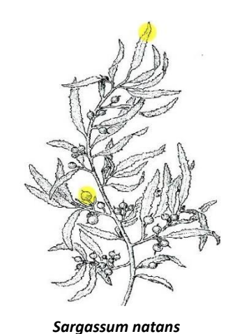
- Pods usually tipped with a spike - Leaves long-stalked and narrow