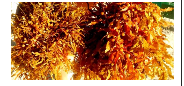
Left: Sargassum natans; Right: Sargassum fluitans

What is it? Pelagic sargassum is a brown alga, or seaweed that floats free in the ocean and never attaches to the ocean floor. These free-floating forms are only found in the Atlantic Ocean. Sargassum provides refuge for migratory species and essential habitat for some 120 species of fish and more than 120 species of invertebrates. It's an important nursery habitat that provides shelter and food for endangered species such as sea turtles and for commercially important species of fish such as tunas. There are two species of sargassum involved in the sargassum influx: Sargassum natans and Sargassum fluitans.