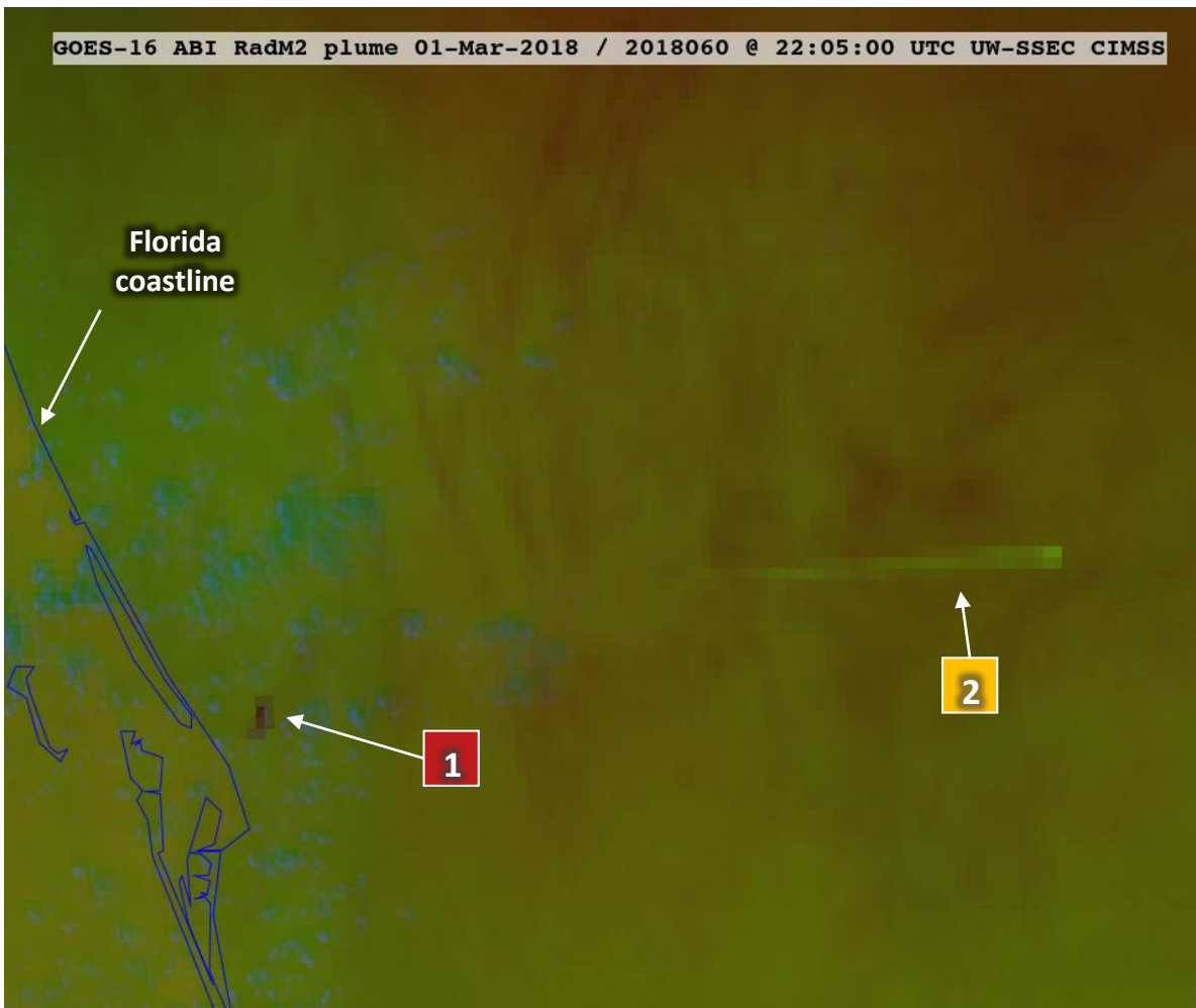
Plume from GOES-16 ABI at 2205 UTC, 01 March 2018.

Note: colors may vary diurnally, seasonally, and latitudinally; plus with hotspots, plumes, moisture amount, etc.