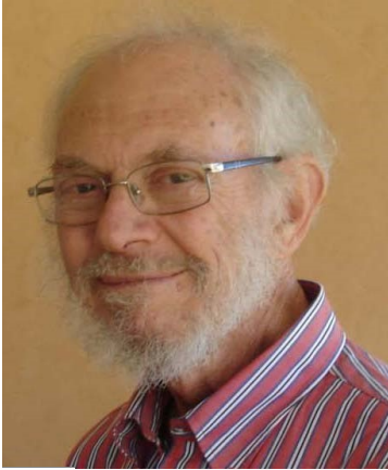
TAU Minor Planet (8258) McCracken