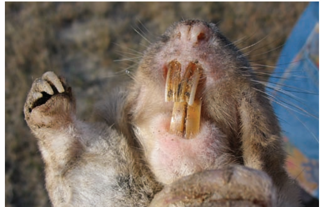
Figure 2. Plains pocket gopher, Geomys bursarius .