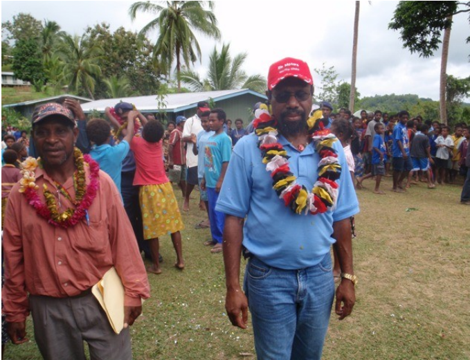
Acting Minister Aimo arrives for the launch ceremony

announced the government's commitment to a full saturation deployment of XO's at the school, which has about 500 students.