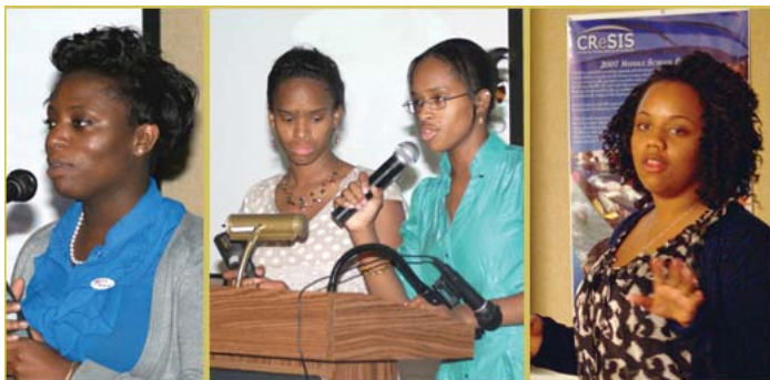
Undergraduate research students present internship opportunities and experiences at the 2009 ECSU Internship Roundtable