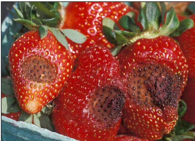
FIGURE 1. ANTHRACNOSE FRUIT ROT CAUSES DARK, SUNKEN SPOTS.

Small, dark lesions develop on stolons and petioles and gradually become black, dry, and sunken. Girdling lesions (FIGURE 5) on stolons result in the death of unrooted daughter plants; leaves die when their petioles are girdled. Small, round, black-to-gray spots may appear on expanding leaflets even before petiole or stolon symptoms are noticed.