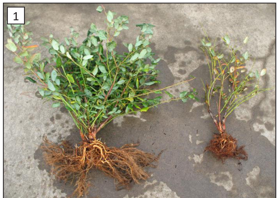
FIGURE 1. A HEALTHY BLUEBERRY PLANT (LEFT) COMPARED TO A PLANT WITH PHYTOPHTHORA ROOT ROT (RIGHT). INFECTED PLANTS HAVE POOR ROOT SYSTEMS DUE TO ROOT DECAY, WHICH RESULTS IN STUNTING, FOLIAR DISCOLORATION, AND EVENTUALLY, PLANT DEATH.

Blueberry root rot is caused by a soilborne fungus-like organism, Phytophthora cinnamomi . It is also known as a water mold because of its requirement for water to complete its life cycle. The pathogen overwinters as chlamydospores, structures capable of surviving adverse environmental conditions for 6 or more years. Once temperatures become favorable (68°F to 90°F) and soil becomes saturated, chlamydospores germinate and produce sporangia (capsule-like structures) containing infective zoospores (motile “swimming” spores with flagella). Zoospores require free water to move into root zones, so wet soils provide the ideal conditions for infections.