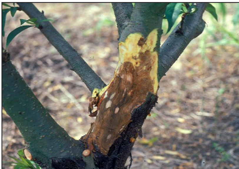
FIGURE 1. REDDISH BROWN DISCOLORATION OF CAMBIUM TISSUE CAUSED BY THE BACTERIAL CANKER PATHOGEN.

This disease may also affect buds in spring (blossom blast), leaves, and fruit.