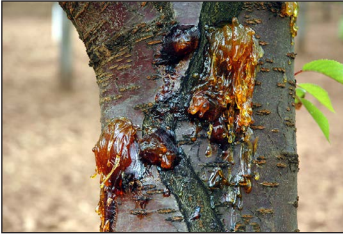
FIGURE 2. ADVANCED BACTERIAL CANKER AND RESULTING GUMMOSIS.