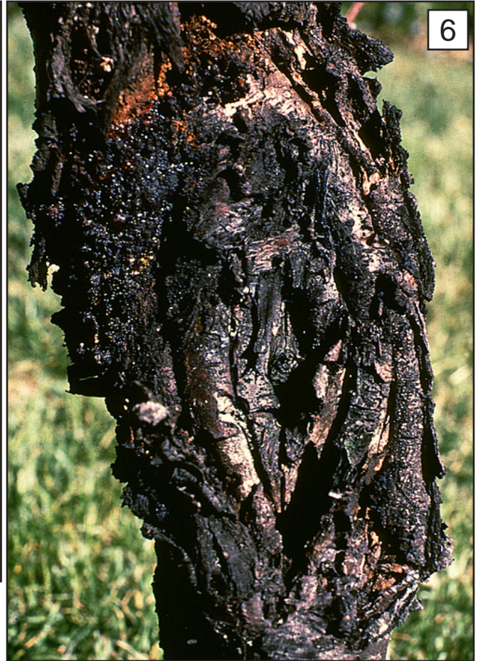
FIGURE 5. EMERGENCE OF ORANGE-COLORED LEUCOSTOMA SPORE MASSES DURING WET CONDITIONS. FIGURE 6. TARGET-LIKE ANNUAL RINGS OF CALLUS TISSUE TYPICAL OF PERENNIAL CANKER.