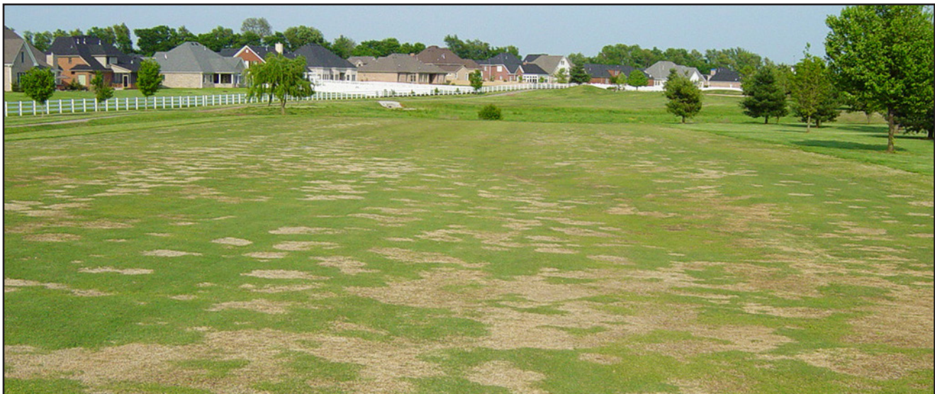
FIGURE 1. SPRING DEAD SPOT PATCHES IN BERMUDAGRASS.

Bermudagrass will often slowly recolonize the dead patches as warmer weather arrives in summer. Regrowth may occur in the center of patches, resulting in tufts of healthy plants (called a “frog-eye” appearance), but more often recolonization is more diffuse. Bermudagrass that has regrown into the patches usually will appear healthy until the following spring. In some cases, however, weeds or cool-season grasses encroach the diseased areas and bermudagrass is unable to compete with them (FIGURE 3). Because patches tend to recur in the same area, expanding patches may appear as rings or arcs of dead turf after 2 to 3 years.