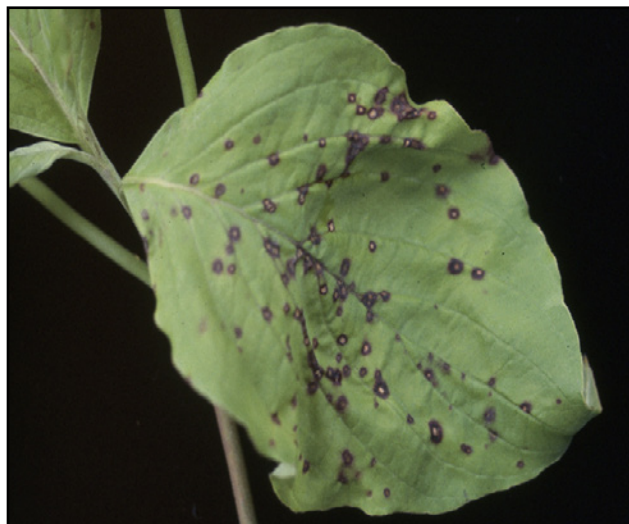
FIGURE 3. SPOT ANTHRACNOSE SYMPTOMS ON DOGWOOD FOLIAGE.

Leaf spots appear as circular or angular dark purple areas (FIGURE 3) usually less than 1/25 inch in diameter. Diseased leaf tissues often drop out, leaving holes or ragged edges within the spots. Severely infected leaves may be reduced in size or killed. Spots on fruit and stems may be dark and are often slightly raised.