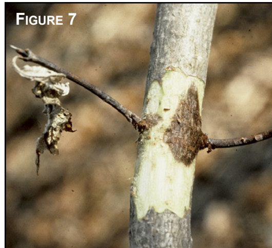
FIGURE 4. DOGWOOD ANTHRACNOSE BEGINS AS SMALL CIRCULAR SPOTS WITH PURPLE BORDERS. FIGURE 5. LEAF SPOTS ENLARGE TO FORM LARGE BLOTCHES ALONG LEAF MARGINS. FIGURE 6. LESIONS MAY EXTEND ALONG LEAF VEINS (PHOTO SHOWS CHEROKEE DAYBREAK, A VARIEGATED CULTIVAR). FIGURE 7. BRANCH CANKERS APPEAR AS DARK BROWN DISCOLORED AREAS BENEATH BARK.