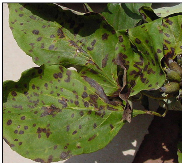
FIGURE 10. SEPTORIA LEAF SPOT CAUSES ANGULAR SPOTS WITH DARK PURPLE MARGINS TO FORM ON INFECTED LEAVES.

Several other fungi cause spotting on foliage of dogwood. The fungus Septoria cornicola is the most common, causing angular grayish spots with dark purple margins (FIGURE 10). Other fungi, including Cercospora , Phyllosticta , and Pestalotia , occasionally cause leaf spotting as well. Fungal leaf spot diseases are most common during wet seasons and in moist, shaded locations.