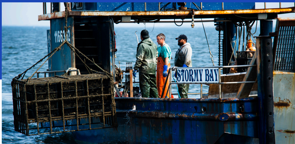
Crew of the FV Stormy Bay tending subtidal oyster cage in Delaware Bay, NJ.