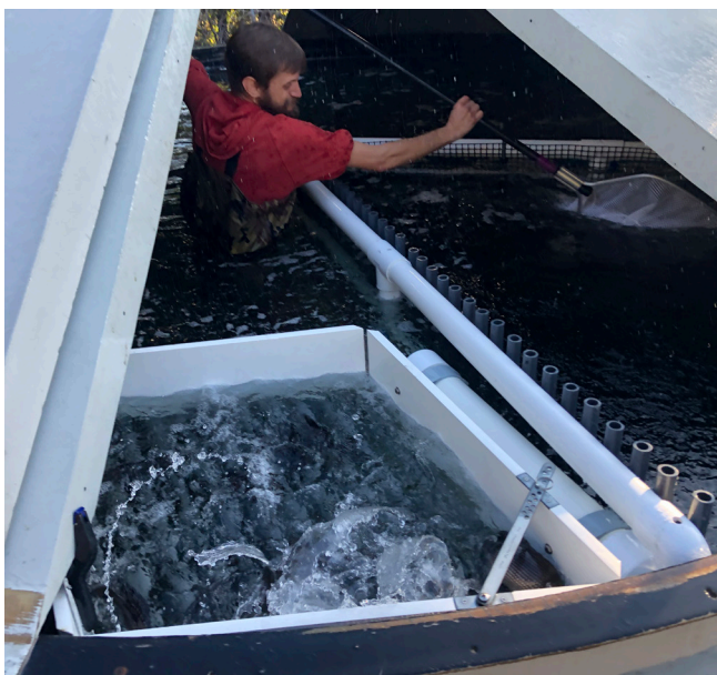
Transferring fish from an in-tank grader to a small grader.

These systems pass seawater through a series of tanks to then be released into surface waters. Upwellers, common for bivalves, circulate water from bottom to top. Raceways are horizontal rows of tanks. Stock may be moved between raceways for more growing space. Wastewater can contain nutrients and solids that affect receiving waters. If appropriate BMPs are not implemented for health requirements and the containment of nonnative species, there is a possibility of nonnative species and disease being released into the environment.