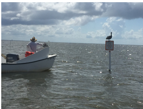
Top to bottom: Loading spat on shell onto a barge for planting on private ground. Aquaculture leases in Florida are used for the production of clams, oysters and live rock.