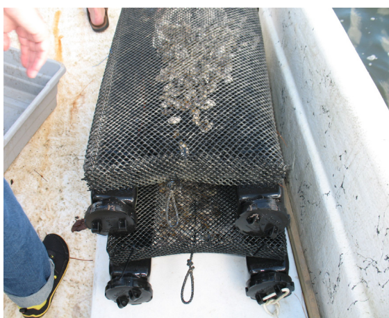
Top: Shellfish seed are grown in nurseries before they are moved to aquaculture leases for further growout.