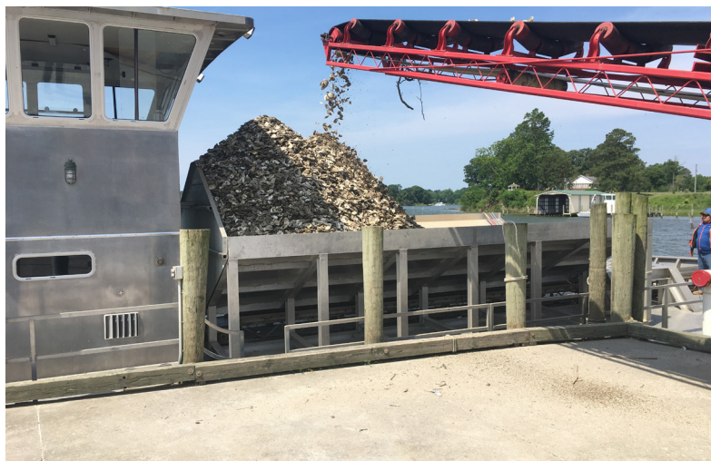
Left: Drone footage of rack and bag grow-out structures at Bay Ridge Oyster Farm, Cape May, New Jersey. Right: Loading spat on shell onto a barge for planting on private ground.

In the Delaware Bay there is concern about aquaculture activities interfering with foraging of red knots, a threatened species that relies on eggs deposited by horseshoe crabs. A number of research projects are under way looking at the effect of aquaculture on horseshoe crabs and red knots.