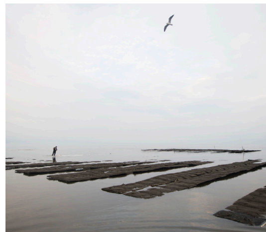
Top: Drone footage of rack and bag grow-out structures at Bay Ridge Oyster Farm, Cape May, New Jersey.