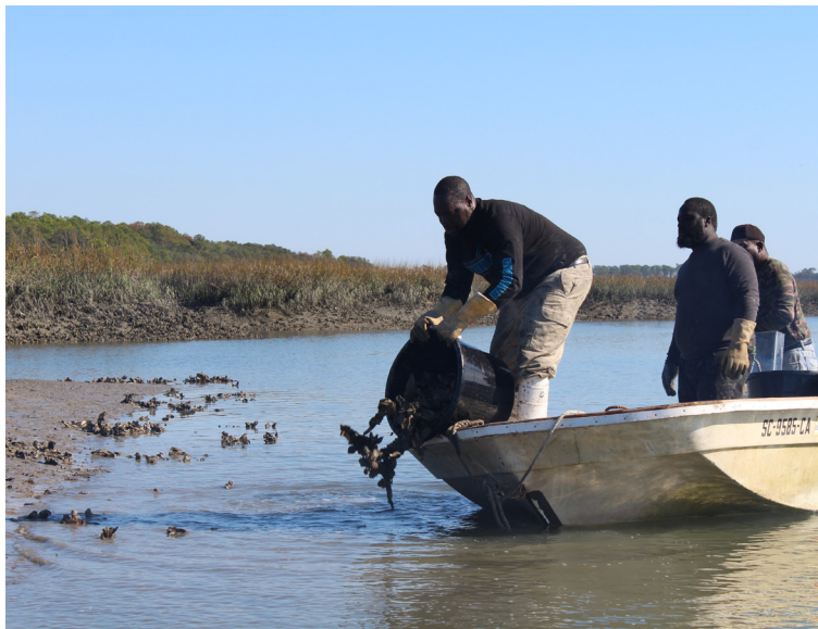
Oystermen in Beaufort County, South Carolina distribute live oysters in order to plant them and encourage oyster reef growth at another site. South Carolina requires commercial shellfish harvesters to replant the grounds from which they harvest in order to keep the state's oyster reefs healthy.

Seed or spat can be spread across the bottom without containment (extensive shellfish culture), called non-structured or bottom-planting, in areas that are accessible by boat and conducive to growth, but not already occupied naturally by oysters or clams. Bottom planting reduces the amount of gear maintenance required, but moving stock (relay) and harvesting require the grower to dredge, pick, or tong the product. Predator screening is typically used to cover younger stocks of clams. Planted oysters have been shown to promote biodiversity by attracting settling invertebrates, bottom feeders, and fish (Forrest et al. 2009).