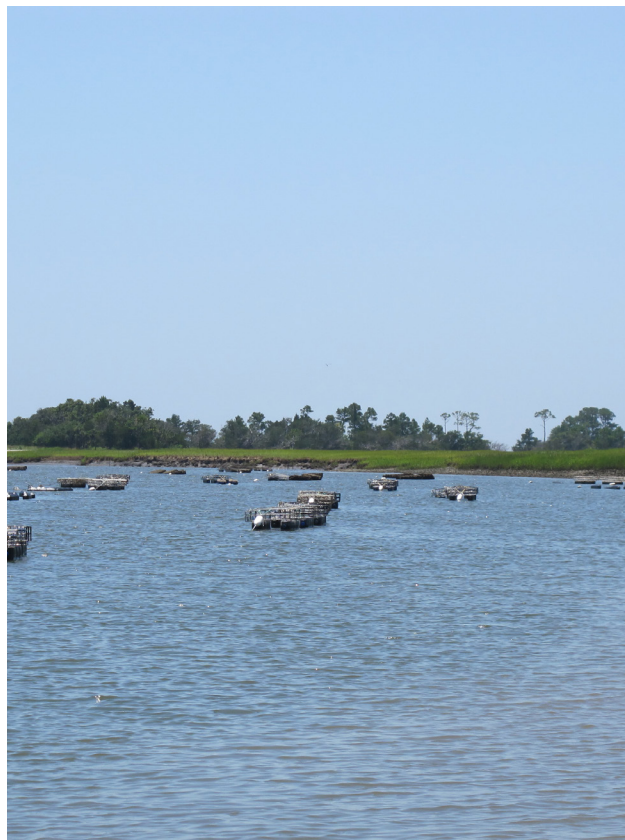
Floating oyster mariculture gear in South Carolina.