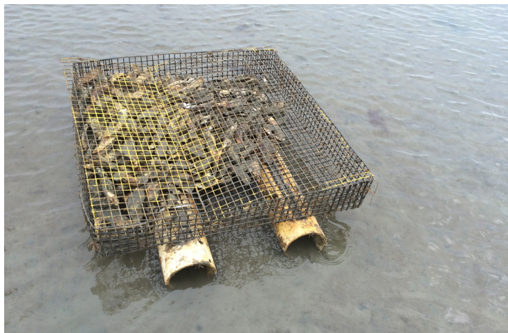
Commercial aquaculture bottom gear (cages) used for culturing oysters in South Carolina.

Cages become habitat for a variety of species, including juvenile and adult fish (Costa-Pierce and Bridger 2002). The Northeast Fisheries Science Center is studying how reef fish are using these cages (NOAA 2019c).