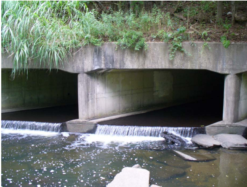
Example of a perched culvert. In this case, downstream weirs can raise the elevation of the water surface to allow fish to swim over the lip.

Full span, bottomless arched culverts that maintain natural substrates are also effective. Setting one box culvert lower than the others in a multiple box installation will provide a minimum flow channel that can effectively pass fish during low flow periods. The installation of baffles inside culverts can be helpful. Perched culverts are usually best addressed by a complete replacement with a culvert that is flat and recessed below streambed level. However, in some cases, the installation of downstream full-width weirs can back-flood a stream up to the elevation of the downstream lip of the culvert.