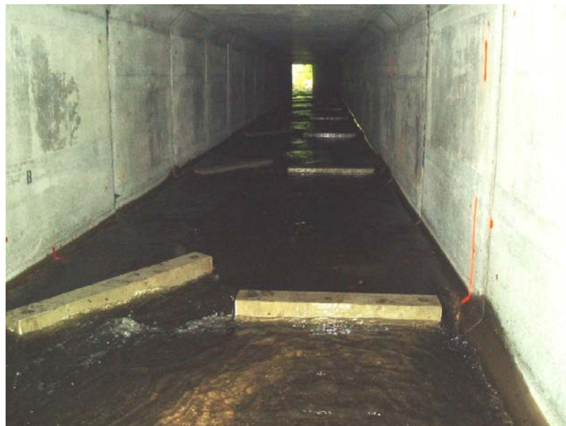
Off-set baffles inside a culvert can reduce velocities and deepen flow to make it passable. In this example, there is a second box with a six-inch lip on the upstream end that diverts all low flow into this box, providing enough water during low flow summer months to pass fish.