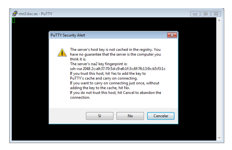
Figure 7: Putty certificate security alert