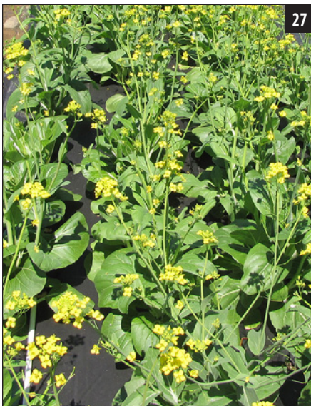
Bolting (flower emergence) in pak choi.

27. Bolting is the emergence of flowers from a vegetable crop. Cole crops are subject to bolting in Kentucky, particularly those planted during spring. Exposure to cold temperatures in early spring followed by rapid warming will often initiate bolting in several cole crops. In many cases,