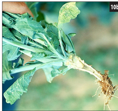
Fusarium yellows on cabbage (a). Vascular discoloration caused by Fusarium on kale (b).