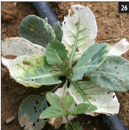
Clomazone (Command) injury on cabbage transplants.

26. Clomazone (Command) is a commonly used herbicide for cabbage production. A pre-emergent herbicide, Command typically bleaches crops where it is applied.