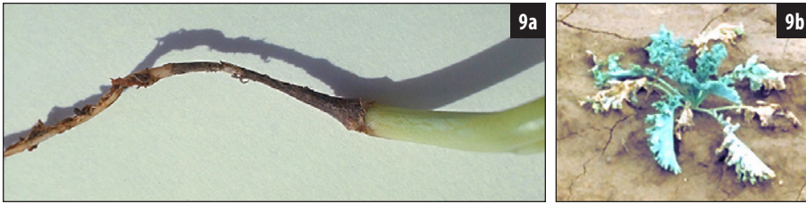
Wirestem on cabbage (a). Wilted kale affected by wirestem (b).

9. Wirestem ( Rhizoctonia solani ) occurs on seedlings after transplanting, and all cole vegetables are susceptible. Sunken, necrotic lesions form at the soil line and are often dark-brown in color. Lesions expand until the stem is girdled, resulting in wilting, collapse, and eventual death of seedlings. The pathogen, R. solani , can cause damping-off of direct-seeded crops.