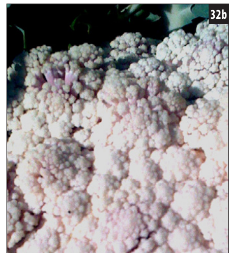
General cold injury on broccoli leaves (a) and on cauliflower (b).