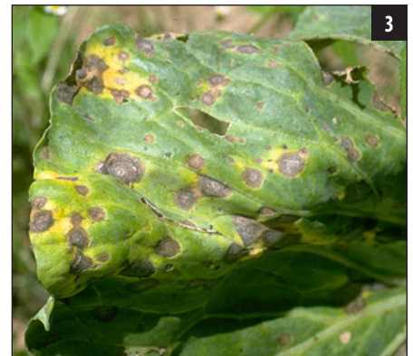
Black rot on leaves of savoy cabbage.