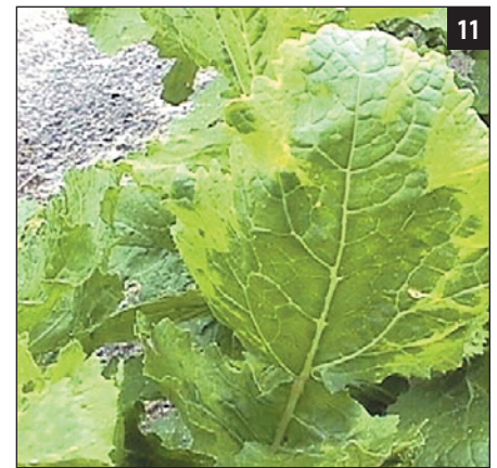
Turnip mosaic on foliage of turnip.