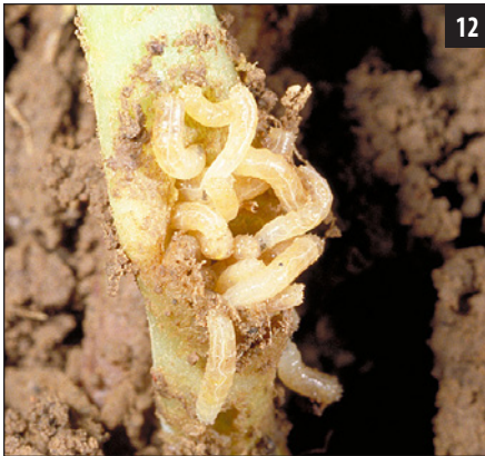
Cabbage maggot on stem of transplant.

12. Cabbage and seedcorn maggots ( Delia spp. ) are in a group of flies that can attack the roots of vegetables. These pests are favored by early planting dates, heavy cover crops, and cool-wet weather. When stand loss or plant injury due to maggots becomes apparent, there are no effective rescue treatments available. These maggots are yellowish white and grow to about 1/4 inch in length when mature. The body is legless with a pointed head and a blunt tail. After about 3 to 4 weeks, the larvae pupate in the soil. The brown pupal cases are hard and football-shaped and are found in the soil near the roots. The adult is a dark gray fly with smoky-gray wings, black legs, and three stripes on its back. Management —Transplanting after the peak of adult emergence and egg laying in the spring will avoid problems. Plow fields at least 3-4 weeks before planting, as freshly plowed fields are attractive for egg laying. Soil drenches with