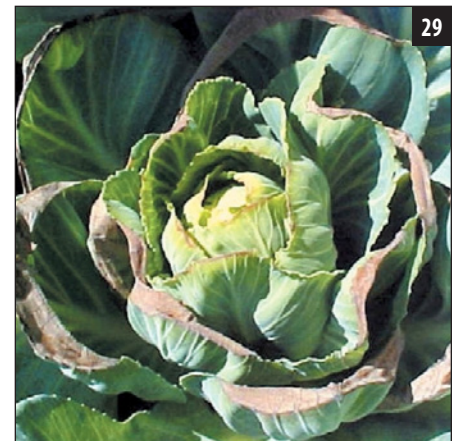
Calcium deficiency of cabbage.

Management —Foliar applications have been largely unsuccessful to correct calcium deficiencies in crops. To prevent calcium deficiencies ensure that adequate calcium is available and ensure that plants are irrigated on a regular basis and avoid large fluctuations in soil water content.