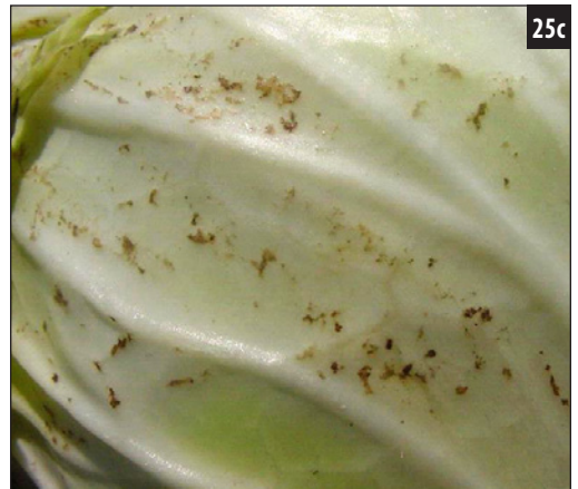
Thrips on a leaf (a), damage to greenhouse seedlings (b), and to mature cabbage head (c).