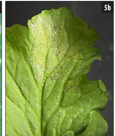
Downy mildew lesions on upper leaf surface of collard (a). Sporulation of downy mildew on the underside of a mustard leaf (b).