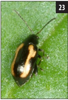
Striped flea beetle.