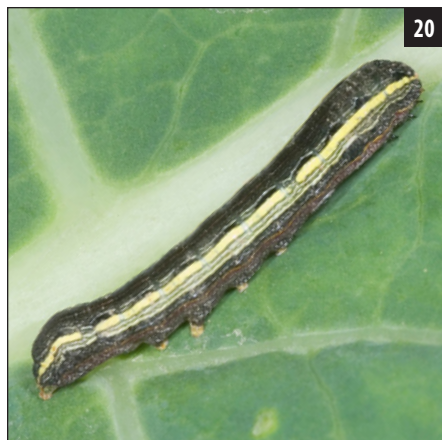
Yellow-striped armyworm on cabbage leaf.

20. Yellowstriped armyworm ( Spodoptera ornithogalli ) is a common pest of many vegetable crops including greens, tomatoes, peppers, and cole crops. The larva varies from dark grey to black in color with two prominent yellow stripes along each side. Below this yellow stripe there are other less distinct stripes including a pink stripe above the prolegs. Two dark triangles may be apparent on the top of each segment. There may be a noticeable dark spot above and behind the hind legs, but this can be difficult to see on darker larvae. The dark head capsule has a net-like pattern. The larva can reach 1¾ inches in length.