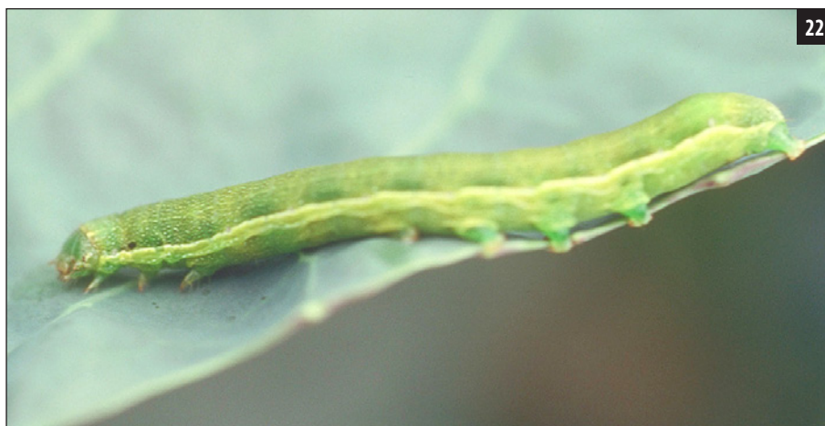
Beet armyworm on cabbage leaf.

Management —Beet armyworm is not as sensitive to the common types of Bt sprays, but those containing Bacillus thuringiensis var aizawai (Bta) are more effective. This pest is highly resistant to pyrethroid sprays (IRAC group 3), so insecticides from others groups need to be selected.