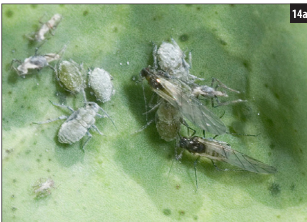
Cabbage aphids on a cabbage leaf (a). Tobacco aphids (b).

Management —Timely destruction of crop remnants after harvest helps to reduce overwintering aphids. Many predators and parasitic wasps can help to manage aphid numbers, so avoiding the use of broad-spectrum insecticides will encourage biological control. Insecticidal soaps as well as selective aphicides are available.