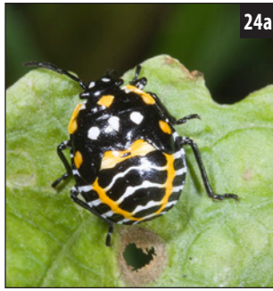
Harlequin bug nymph (a) and adult (b).