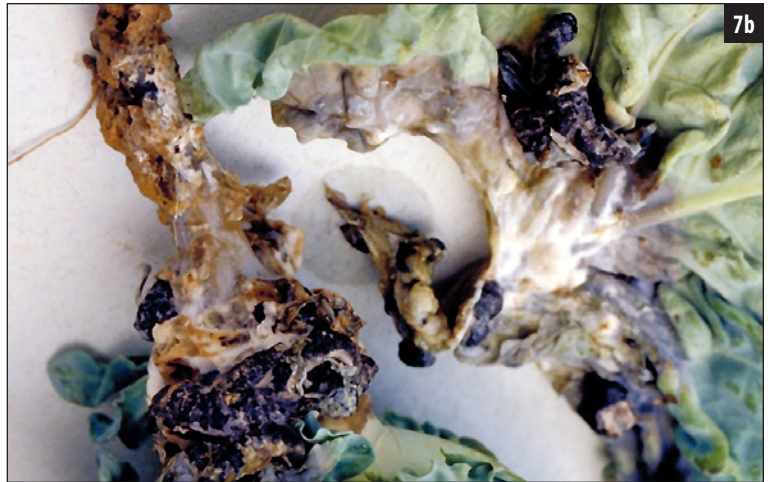
Wet rot and fungal growth (mycelium and sclerotia) caused by Sclerotinia on cabbage head (a). White mold on lower stem of cabbage (b).

7. White mold ( Sclerotinia sclerotiorum ) affects the majority of cole vegetables, but is found most often on cabbage in Kentucky. On cabbage, symptoms occur first on tissues near the soil line, and generally appear as a soft, wet rot that is light brown in color. The necrotic area will extend to the head as the fungus invades these tissues, resulting in extensive soft-rotting. Under humid conditions, a profuse white mycelium may be present on infected plant parts, along with numerous black-colored rest-