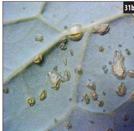
Edema on cabbage leaves (a). Closeup of edema on cabbage leaves (b).

32. Cold injury. Cole crops are fairly cold tolerant. Nearly all cole crops can tolerate temperatures below freezing, though vary in what temperatures will result in cold injury. Symptoms of cold injury can appear as a purpling of leaves. This results from the production of additional anthocyanins at low temperatures. In cauliflower, low temperatures can result in a browning or reddening of the curd. Cauliflower tends to be more sensitive to cold temperatures than other cole crops.