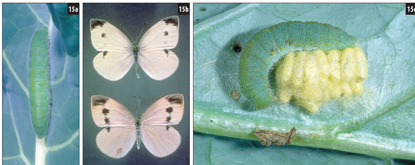
Imported cabbage worm larvae (a) and moth (b). Wasp cocoons from an imported cabbage worm (c).

15. Imported cabbageworm ( Pieris rapae ) larvae are velvety green with a narrow, light yellow stripe down the middle of the back and have four pairs of prolegs in addition to the three pairs of true legs behind the head. The larvae reach 1¼ inches in length. The pupae is greenish in color and attached to the undersides of cabbage leaves (without a silk case). The adult is a white butterfly with a few simple black markings. The bullet-shaped eggs are laid singly, have distinct ridges, and are initially white when laid but turn dark yellow as they mature. Imported cabbageworm cause similar damage as loopers, but feed closer to the center of the plant. Larvae are often concealed next to veins or the midrib on the underside of the leaves. Scouting for eggs and larvae should begin as soon as the white butterflies are seen flying about during the day. Late in the season, many of the larvae may become parasitized and wasp cocoons noticeable, do not include these in scouting counts. Management —Watch fields for white butterflies on warm days in the spring, this is an indication to begin scouting for eggs on leaves. Watch for larvae on the youngest leaves near the bud of the plant. Bt sprays can be very effective against this caterpillar.