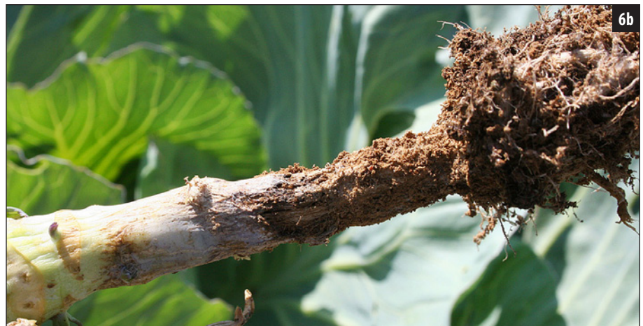
Wilting (a) and stem canker (b) on cabbage caused by Phytophthora .