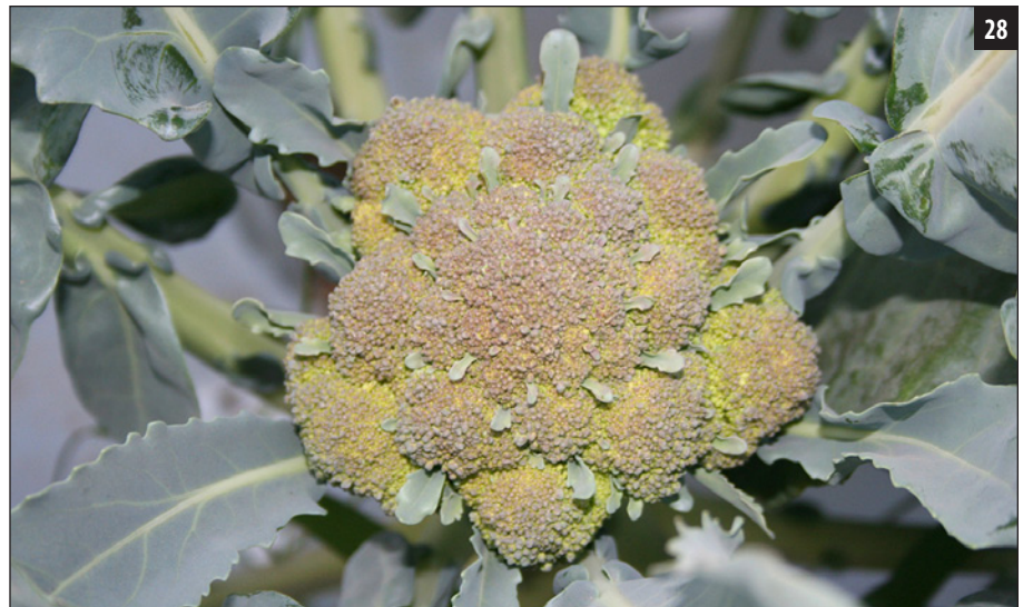
Broccoli head past maturity.

planting crops late in the spring on black plastic can exacerbate bolting. Bolting will make crops unmarketable and result in a strong bitter flavor if consumed by home gardeners.