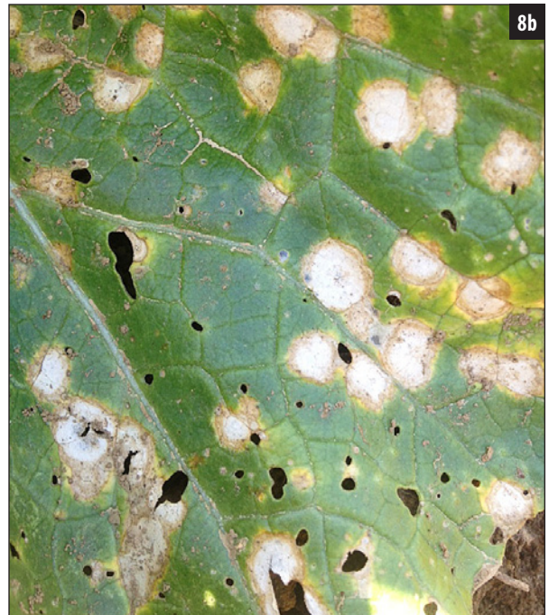
Lesions (a) and severe blighting (b) of napa cabbage caused by white leaf spot.