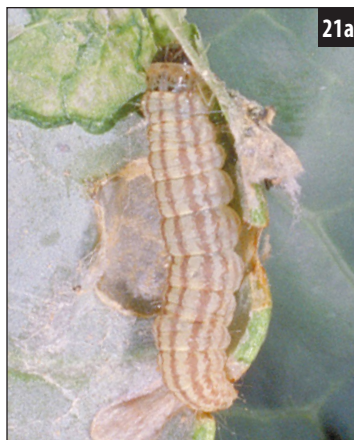
Cabbage webworm caterpillar (a) and moth.

21. Cabbage webworms ( Hellula rogatalis ) are easily recognized. Unlike other caterpillar larvae that attack cole crops in Kentucky, this larva has a black head capsule. Larvae are tan colored with four brown stripes running the length of the body. Larvae are often found inside webbed pockets formed along the leaf margins. Initially damage appears as small (quarter sized) brown, dried areas along the leaf margins. The moth has brownish-yellow forewings mottled with darker