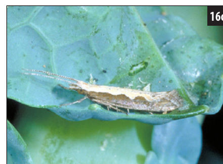
Diamondback moth caterpillar (a), pupae (b), and adult (c).