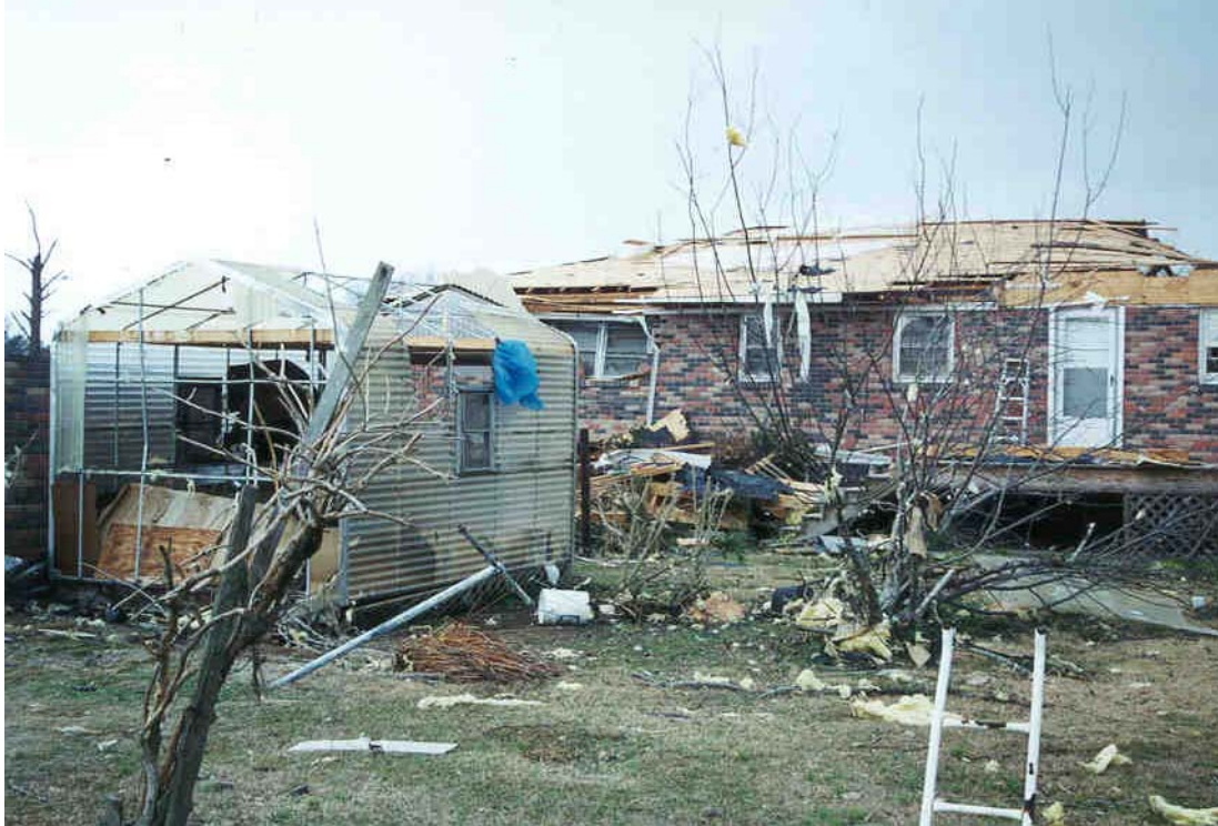
Figure 3. Englewood Meadows Home

From Englewood Meadows the tornado proceeded in a northeasterly direction crossing open ground until it struck the nearly complete and not yet occupied Englewood Village Market Place which contained the Winn Dixie Supermarket. The shopping village was constructed of built-up roofing on metal decking attached to steel bar joists bearing on joist-girders, columns and unreinforced masonry (URM) walls. The joist and girder spans were long, and the URM walls were tall (see Figures 4 and 5).