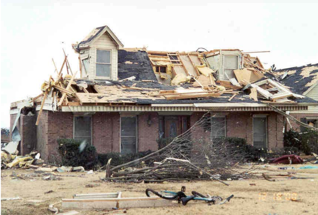
Figure 7. Hinton Place Residence, near vortex

Hillcrest Meadows was adjacent to and downwind from Hinton Place. Figure 8 portrays a line of homes on the windward side of the subdivision. The home in the foreground was totally destroyed and was presumably under the vortex of the tornado. This photo also indicates the progression of damage (from most to least). Roof damage was predominate in both subdivisions, with wall and other major damage only occurring under or near the narrow vortex.