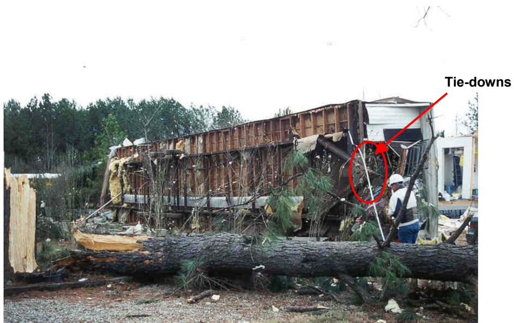
Figure 2. Englewood Meadows Mobile Home

The mobile home in Figure 2 represents the classic definition of the F1 description – “trailer houses pushed or overturned” (Fujita, 1971). The trailer had tie-downs and was underpinned. Photographs of the adjacent homes, Figure 3, present damage consistent with the F1 description, “roof surfaces peeled off and windows broken” (Fujita, 1971). However, the assigned wind speeds for an F1 tornado by Fujita would approach the reserve strength of the site built homes and presumably can devastate the mobile home. The assumption drawn was that either the homes were constructed better than the standard or that the wind speed better fit the category of F0 winds.