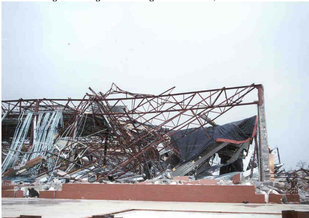
Figure 5. Englewood Village Market Place, windward wall