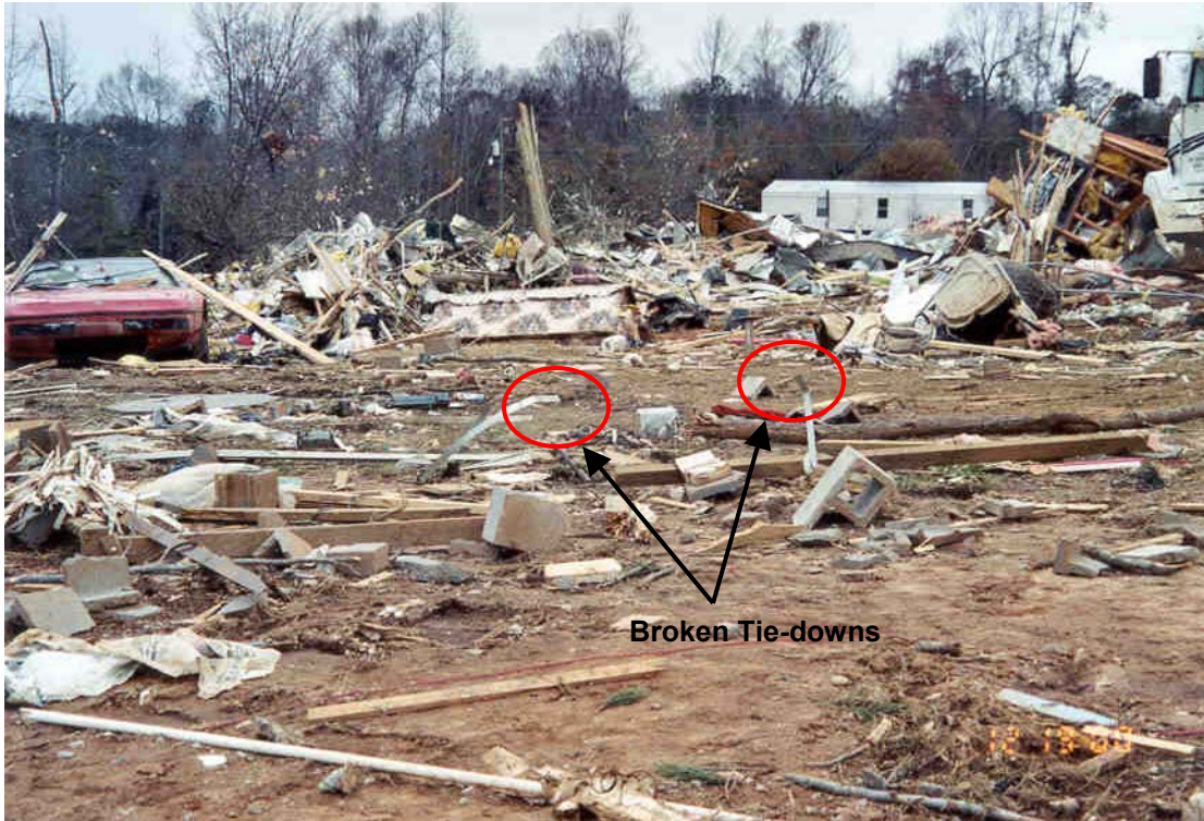
Figure 13. Bear Creek Mobile Home Site with broken tie-downs