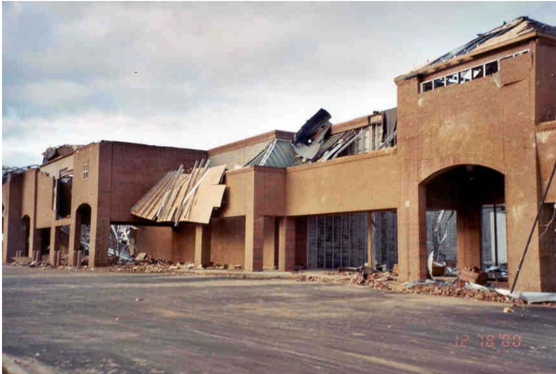
Figure 4. Englewood Village Market Place, leeward wall