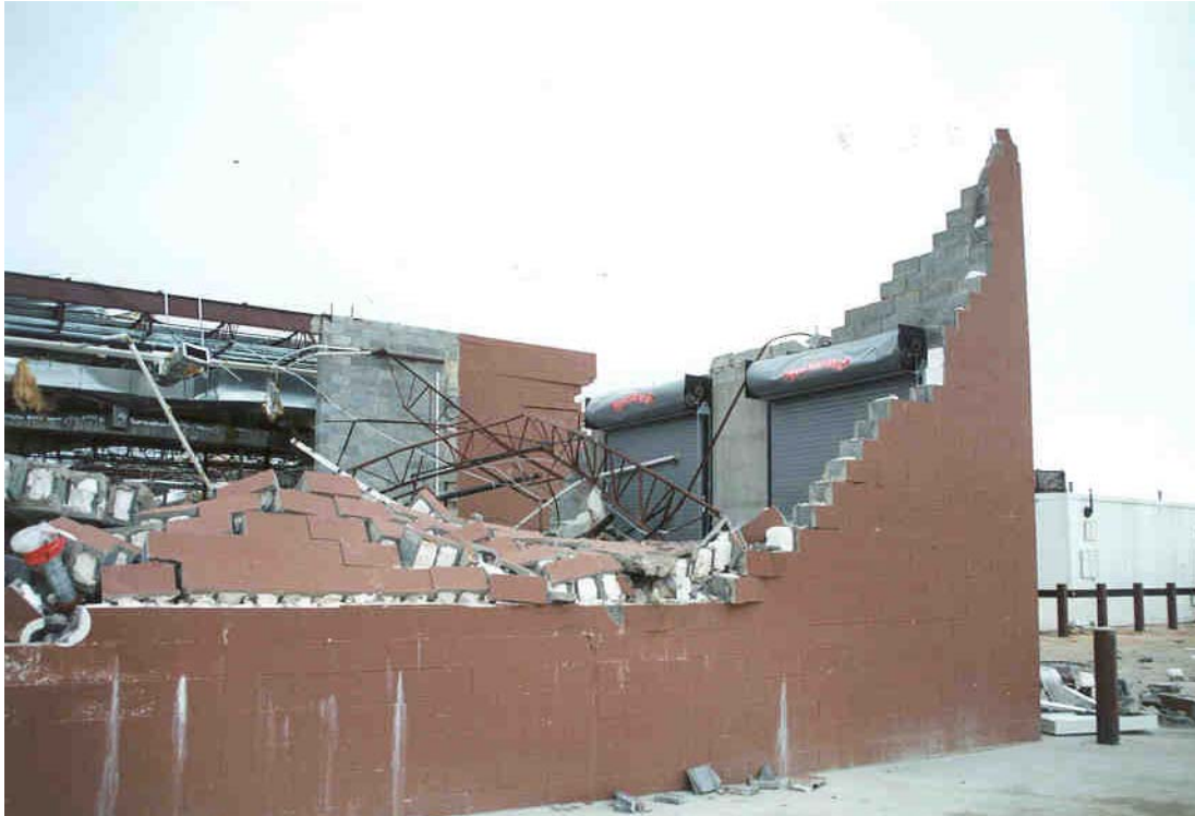
Figure 6. Englewood Village Market Place, internal pressurization

The shopping center building was under construction and was nearly complete; however, the window wall systems had not been installed. Therefore, for wind analysis purposes, the building would be considered as a partially enclosed structure. The wind forces acting upon the structure would have included both external and internal pressures. The combination of these forces tore the decking from the joists, thereby snarling the light steel structural elements and pulling down the URM walls. Further evidence of the internal pressurization is shown in Figure 6. The rolling doors, which would have experienced windward external forces, remained in place due to the negating internal pressures, while the roof deck experienced the combination of internal and external