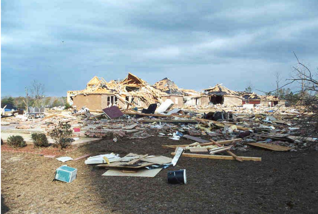
Figure 8. Hillcrest Meadows Residence, showing gradation of damage from center of tornado

As previously mentioned, considering construction standards and the reserve strength factors, the residence in Figure 8 could have been destroyed by winds in a range for an F2 tornado. The level of damage to the adjacent homes further supports this theory and demonstrates the range of wind speeds away from the vortex.