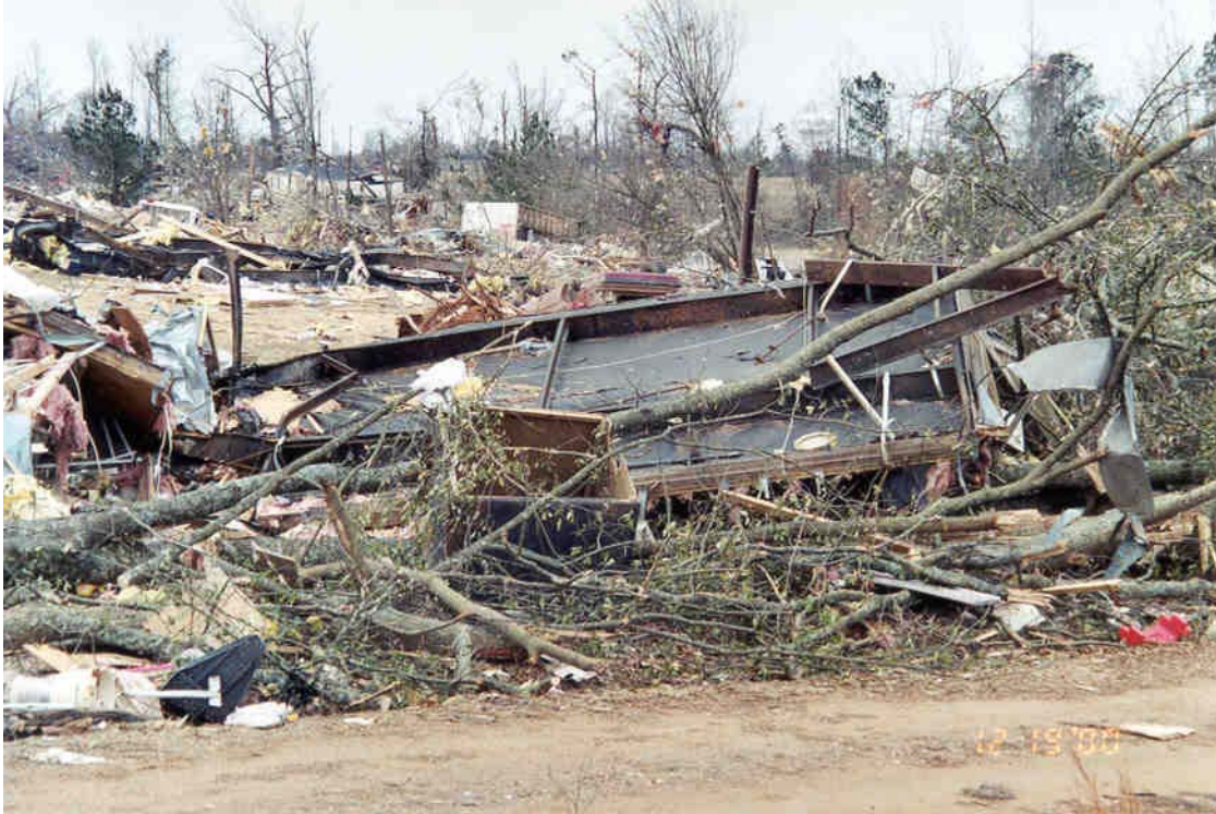
Figure 14. Destroyed Manufactured Housing, Bear Creek

that of the Hinton Place and Hillcrest Meadows subdivisions; however, ten of the twelve storm-related deaths occurred in the Bear Creek Park. Given this similar intensity of wind speed, it can only be assumed that the large loss of life is attributed to the difference in construction types and quality of construction.