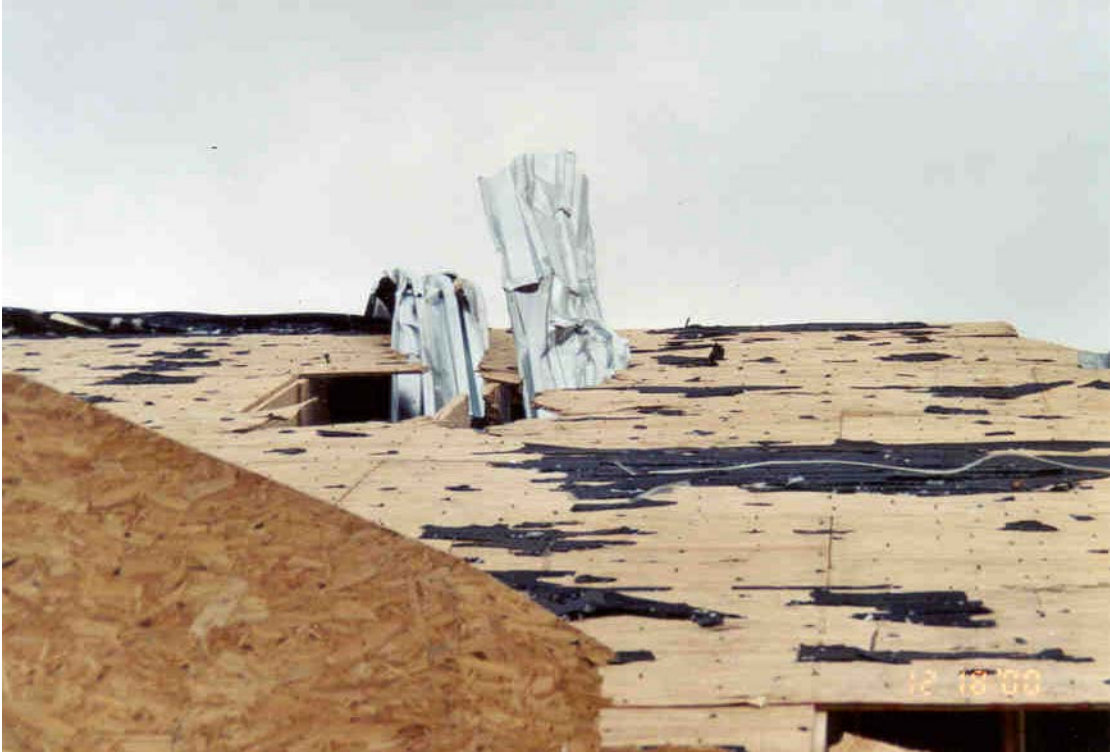
Figure 9. Sheet Metal Missile, Hinton Place