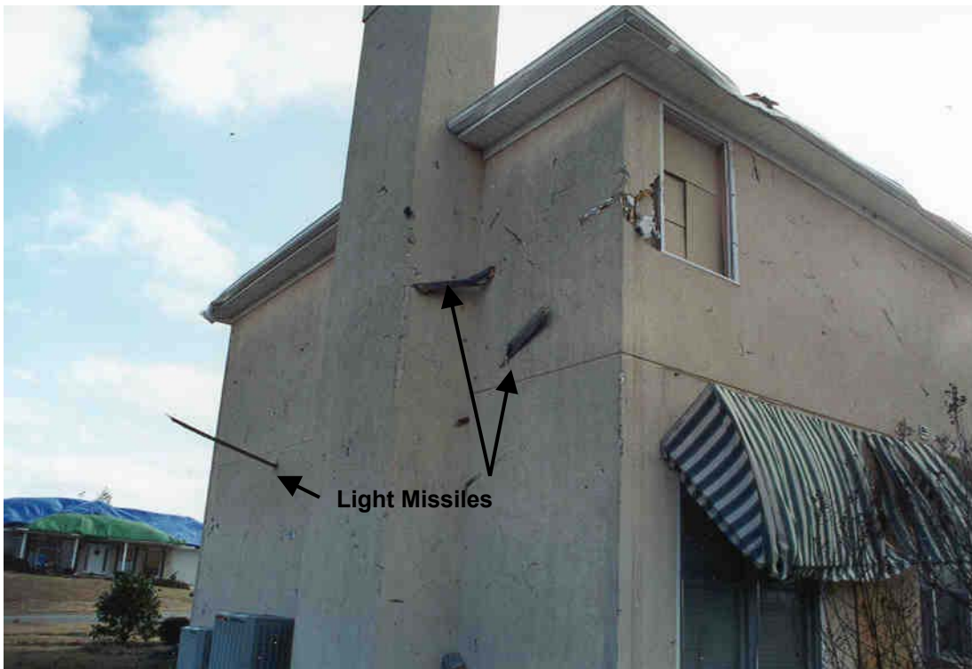
Figure 10. Missiles, Hillcrest Meadows