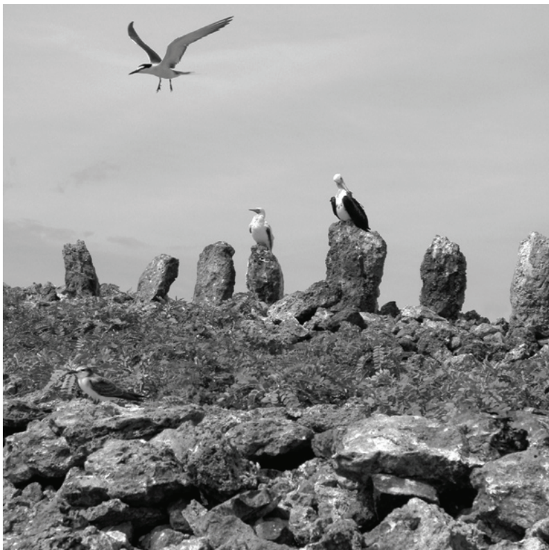
Mokumanamana's upright stones