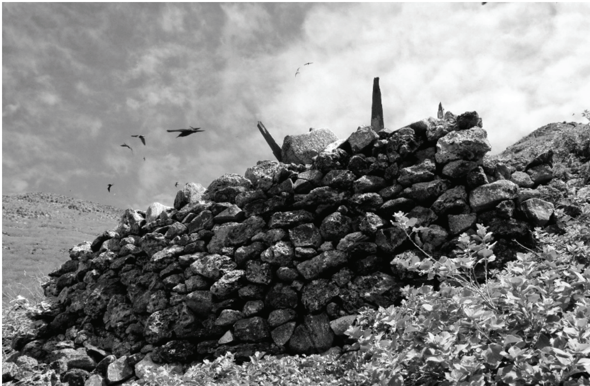
Religious site at Nihoa Island