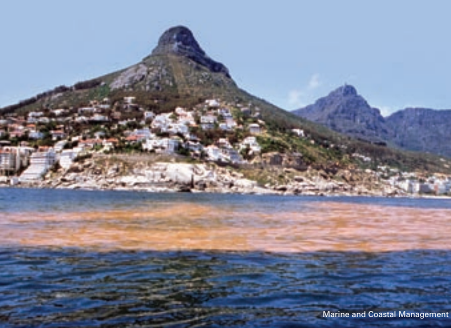
Marine and Coastal Management

Invasive alien species are introduced species that become established in a new environment, then proliferate and spread in ways that are destructive to human interests and natural systems.