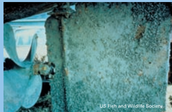
US Fish and Wildlife Society

Biofouling algae and invertebrates may attach themselves to any boat surfaces that remain submerged, such as hulls and propellers, as well as those in intermittent or continuous contact with water, such as anchors and water pipes. Once the vessel has arrived at its destination, the biofoulers and their offspring may quickly 'jump ship' to colonise new areas, with nearby wharf pilings and breakwaters offering convenient settlement sites. Slow-moving barges and oil rigs are especially implicated in the transfer of invasive species, as they often spend lengthy periods in one location – increasing the risk of colonisation by biofoulers – and are cleaned infrequently, since the increased drag and fuel consumption associated with biofouling is not critical to their operational profit margins.